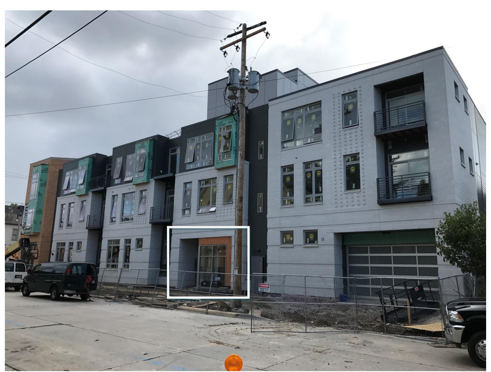
August 2017 view. Signs to be installed in highlighted area. Address numbers ahll be in the recess.