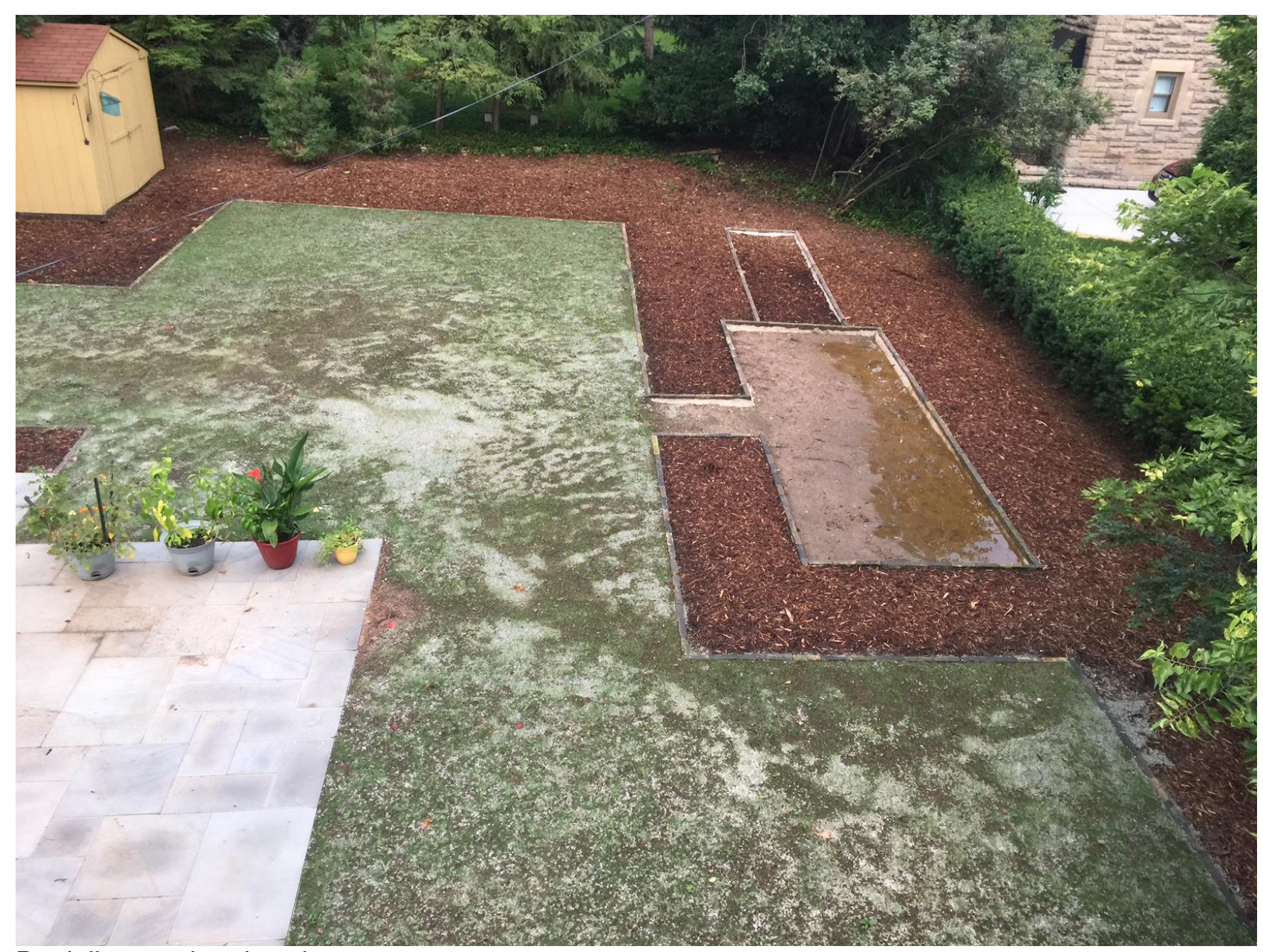
Partially completed work