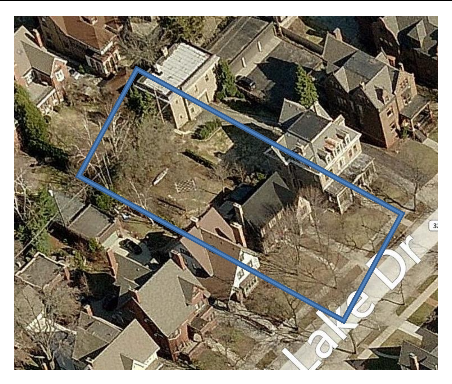
Aerial view of property prior to work.