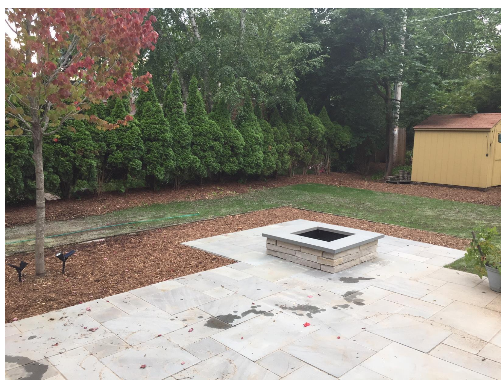
Partially completed work with firepit and new tree at left.