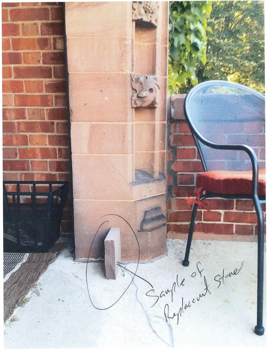
All cravings to be duplicated exactly or re-used.