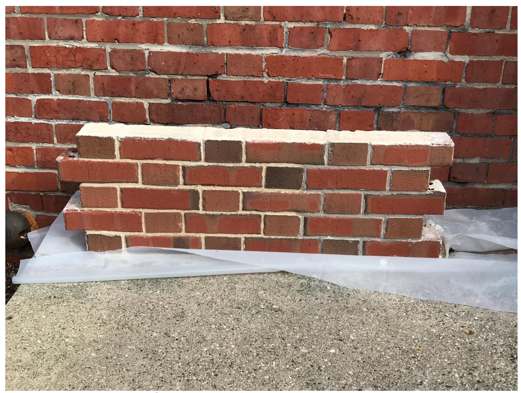
Two color mortar test panel. Sandy color at left is to be used. Also showing typical wall condition with mismatched mortars from previous attempts at repairs.