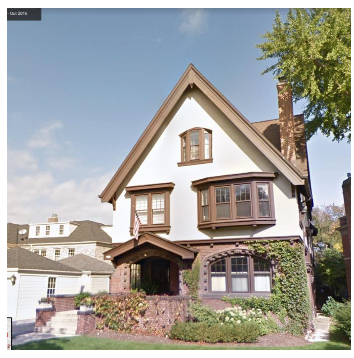
Current view of property.