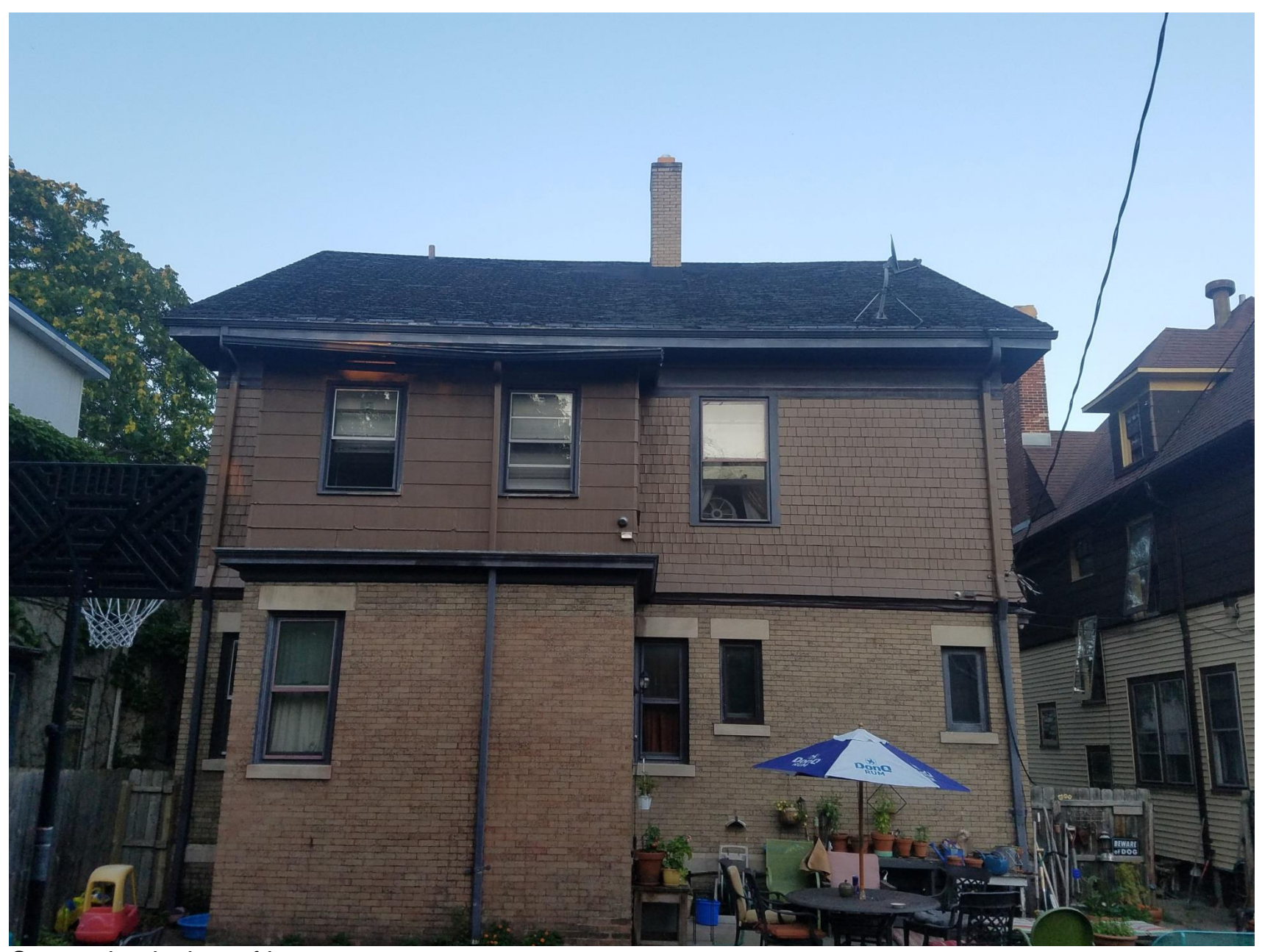
Current back view of house.