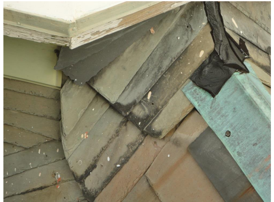
Slate in this area on all sides will be realigned for better drainage. Individual slates may be replaced as needed.