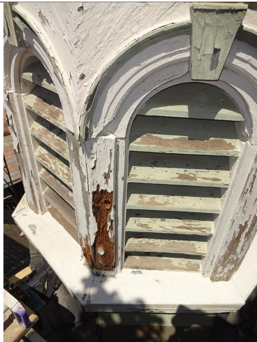
Present detreated state, August 2017