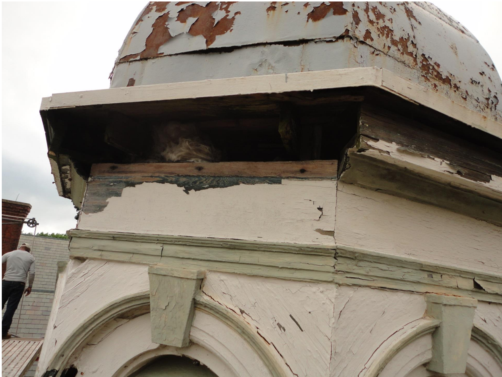
Additional deterioration and missing pieces