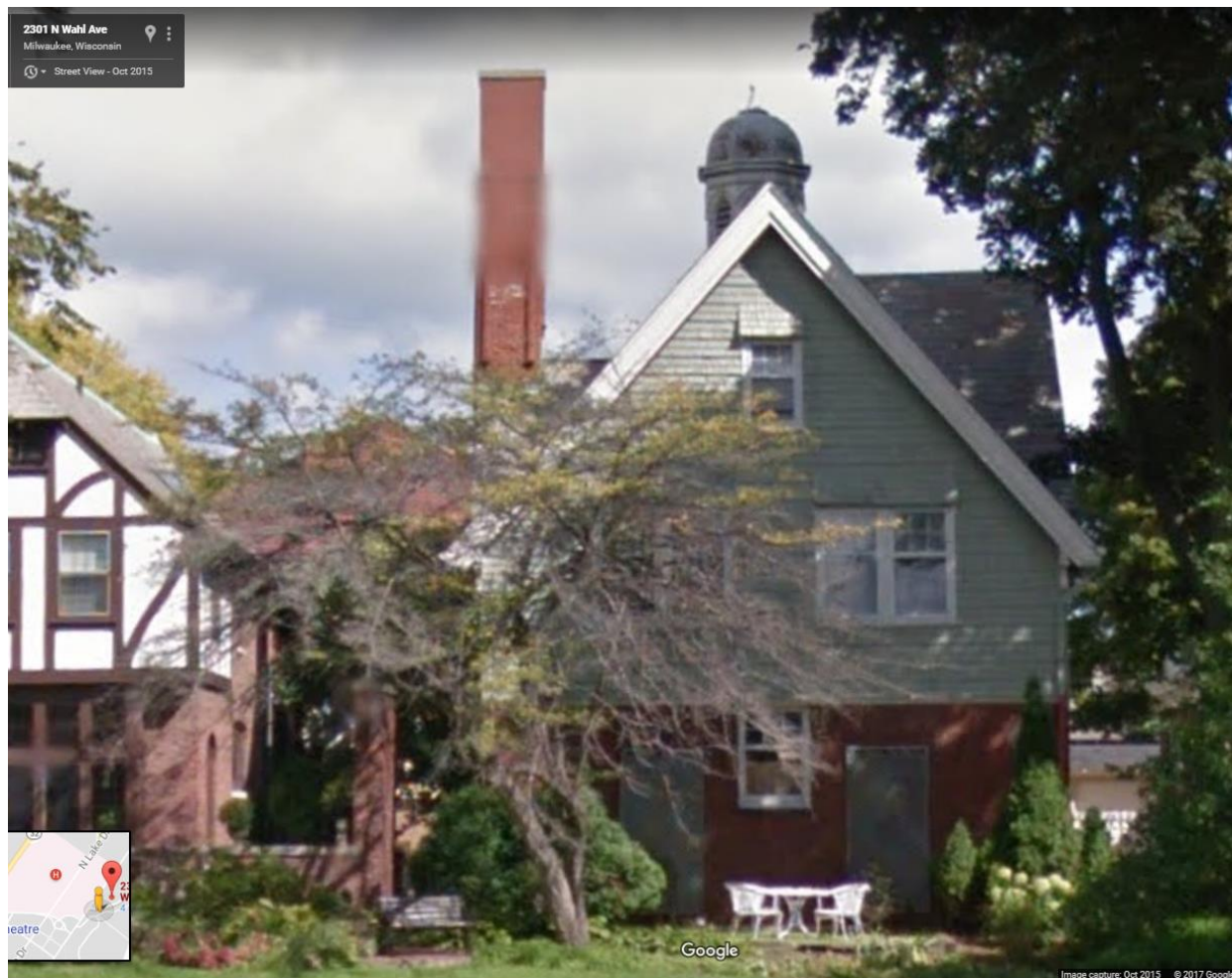
Subject building, October 2015