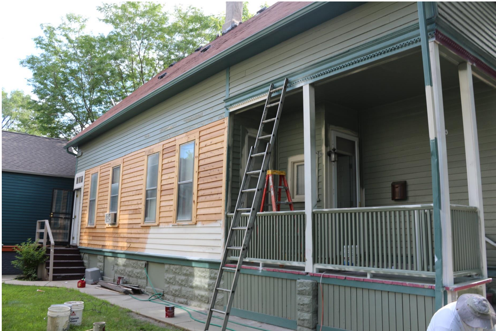
Staff site visit, 7/20/2017