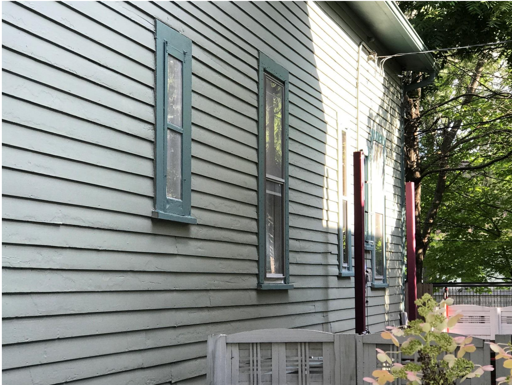
West side of house showing no recent work for comparison to test panel on previous page.