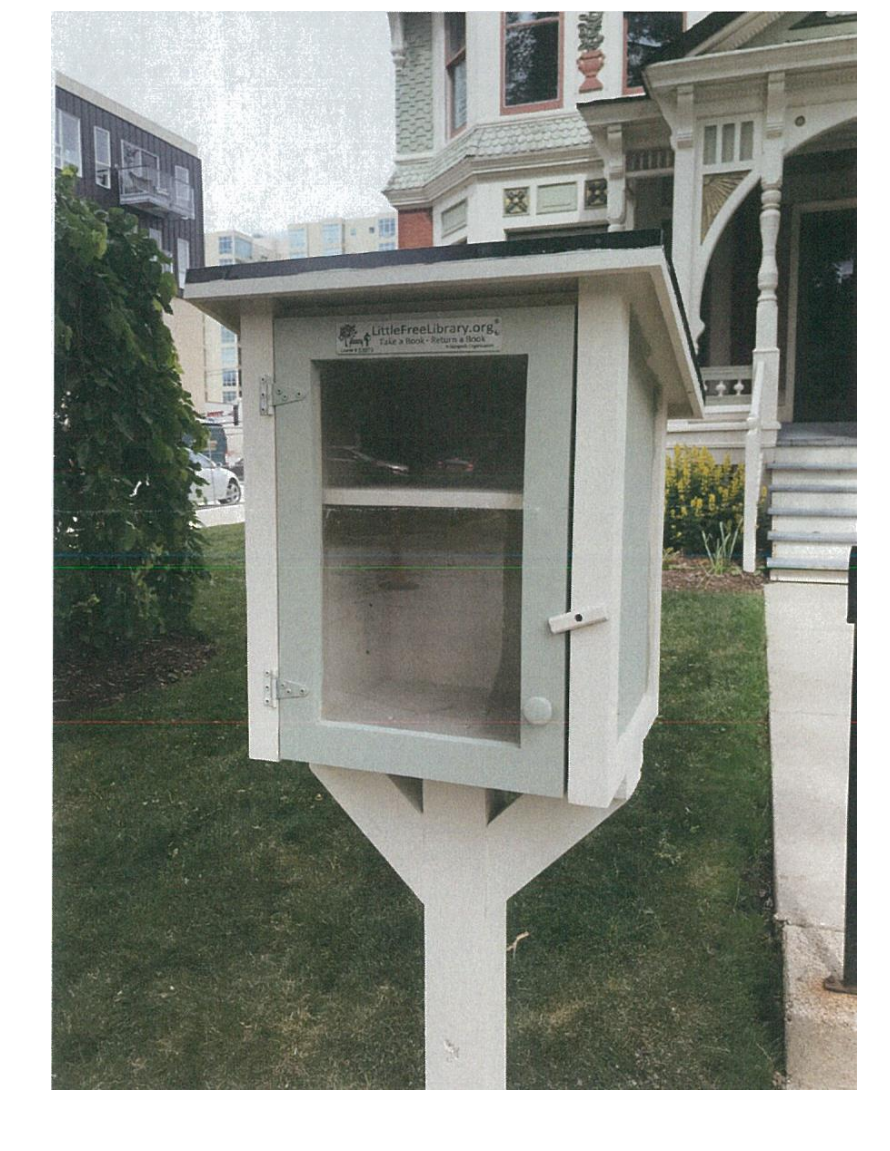
House and cloesup of library structure