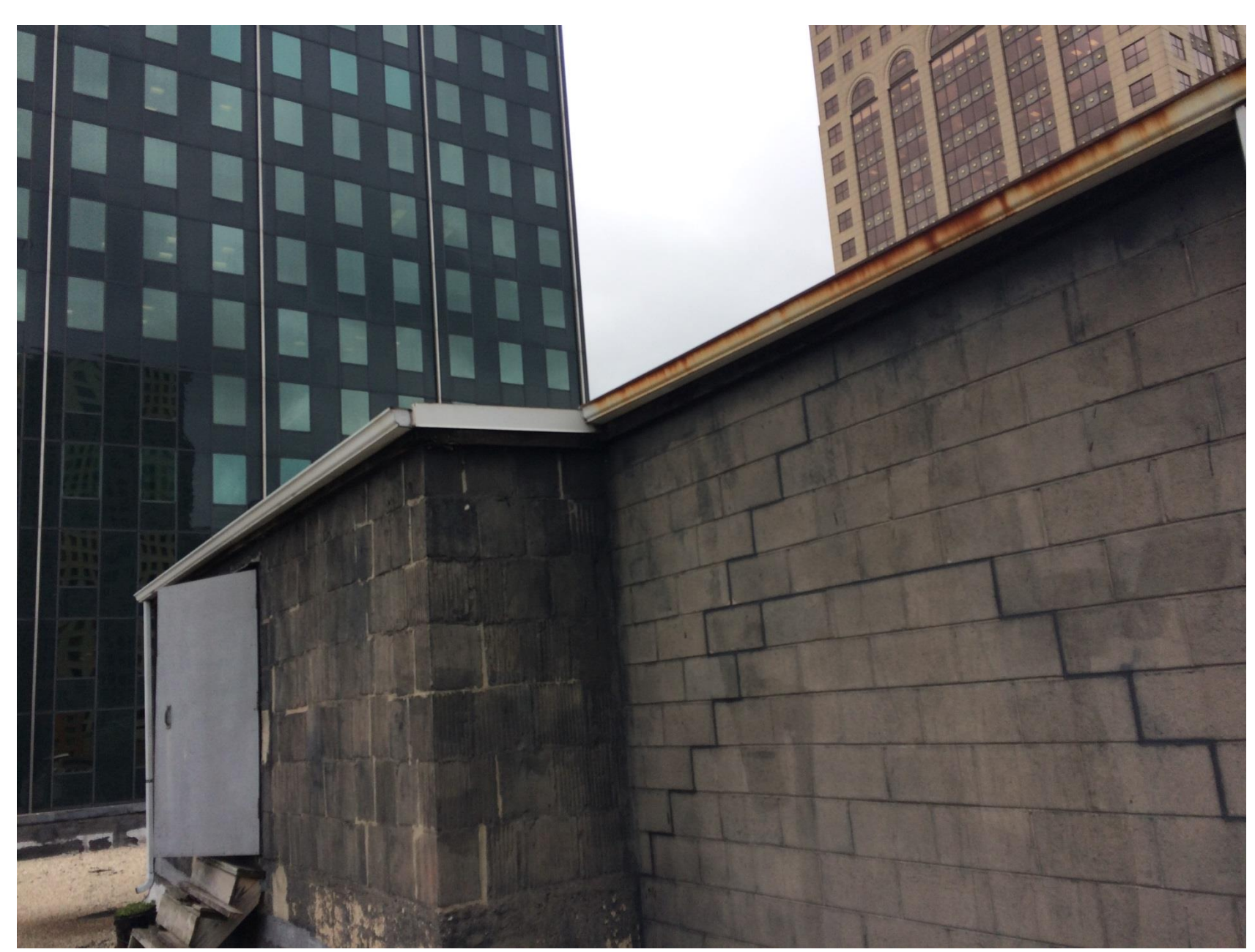
Penthouse showing fascia and gutters to replace