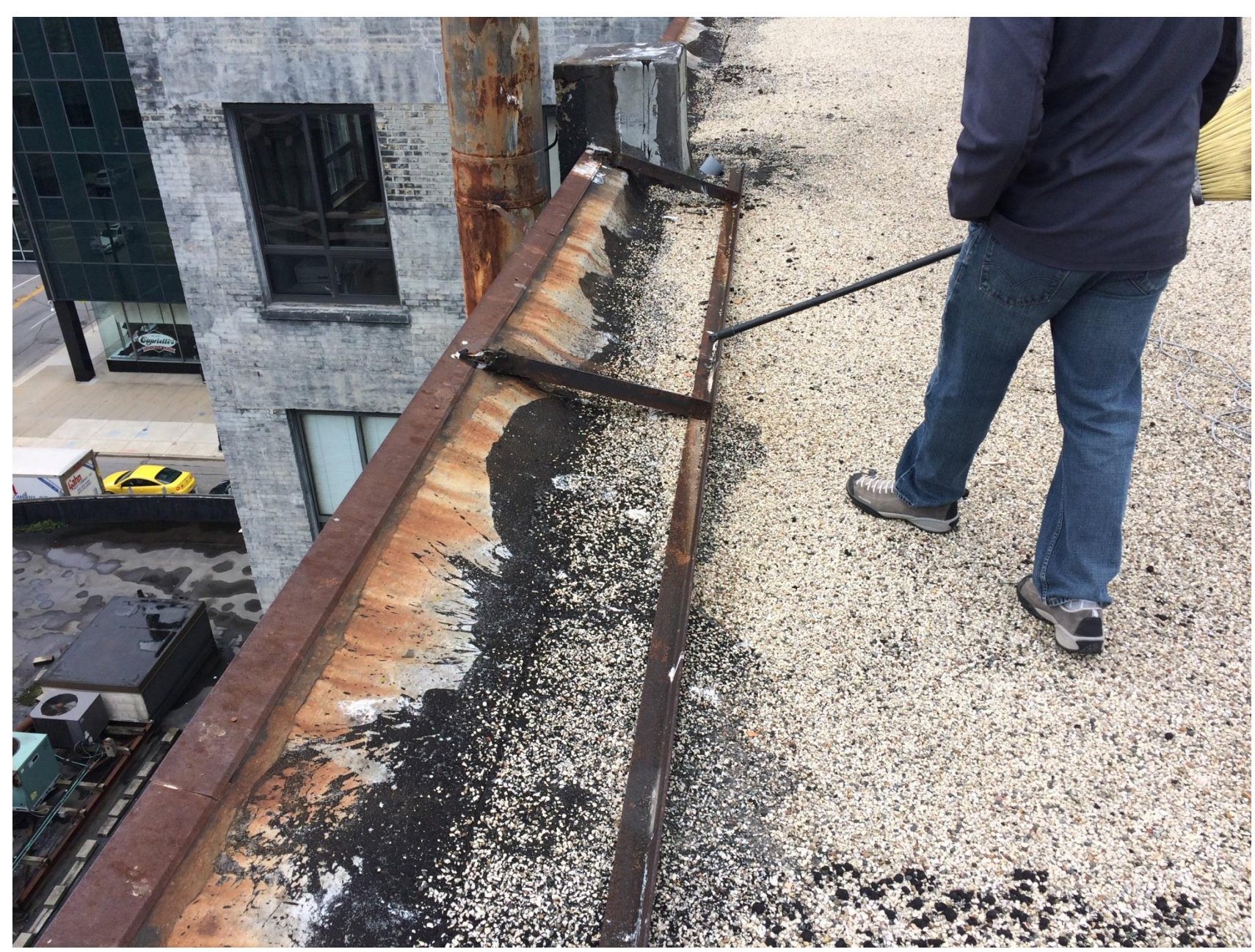
Current roof and deeply rusted fascia