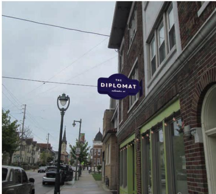
proposed day view [NTS]

Method: Repaint Cabinet and Mounting to Match Face [TBD]