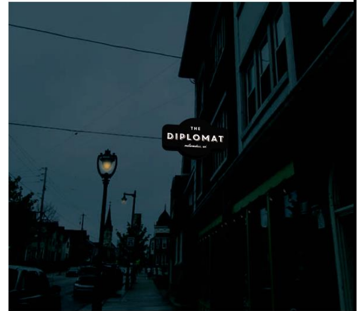
proposed night view [NTS]