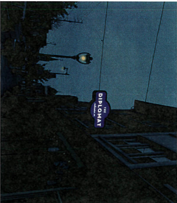
proposed night view [NTS]