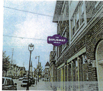
proposed day view (NTS)