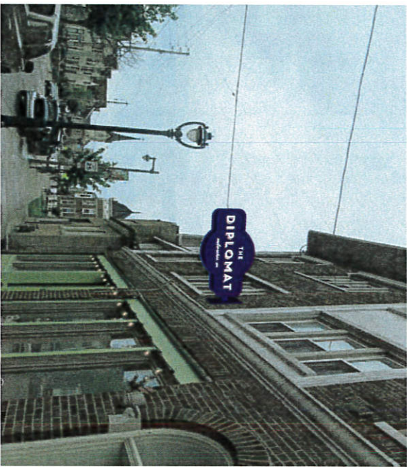
proposed day view [NTS]

Method: Repaint Cabinet and Mounting to Match Face [TBD]