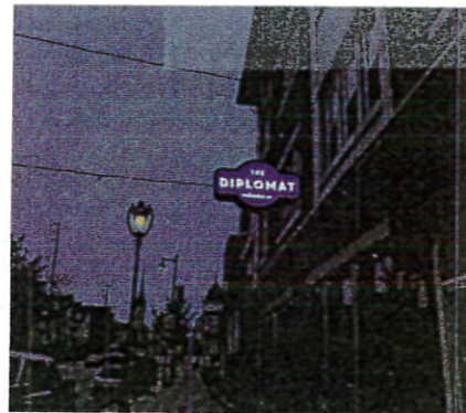
proposed night view (NTS)