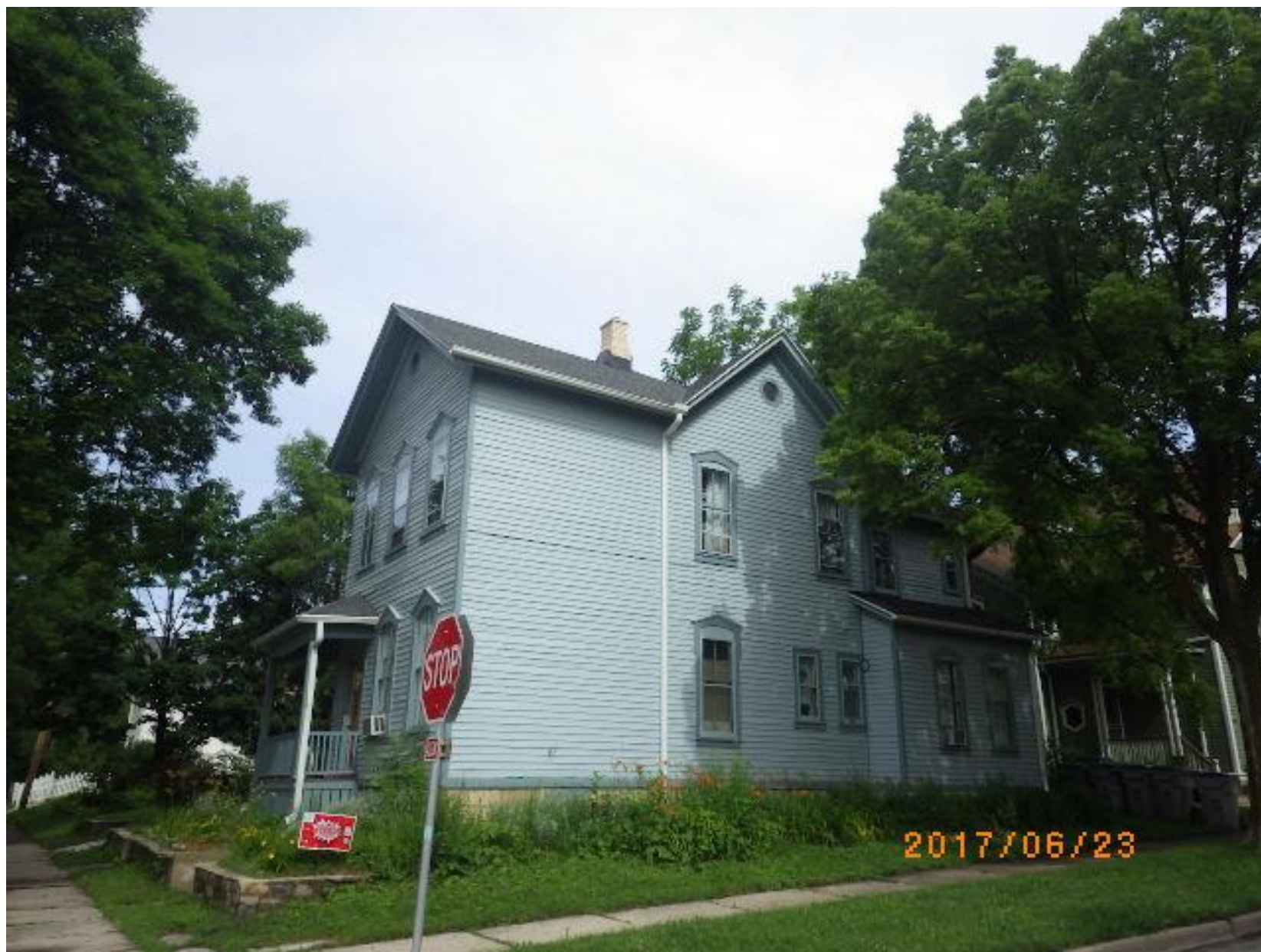
Side view with front chimney to be rebuilt in salvaged cream city brick.