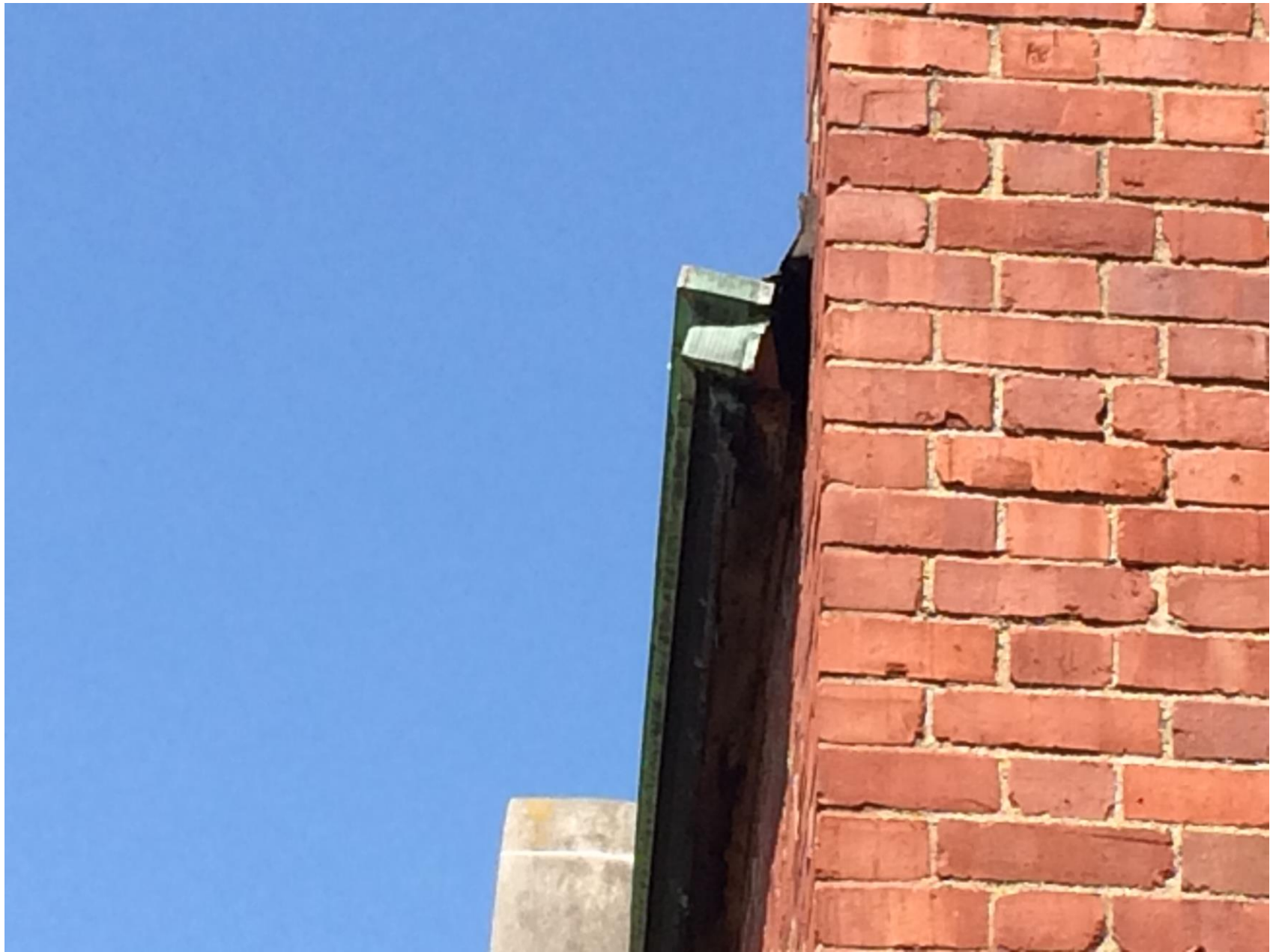
3422 N Lake gutter detail