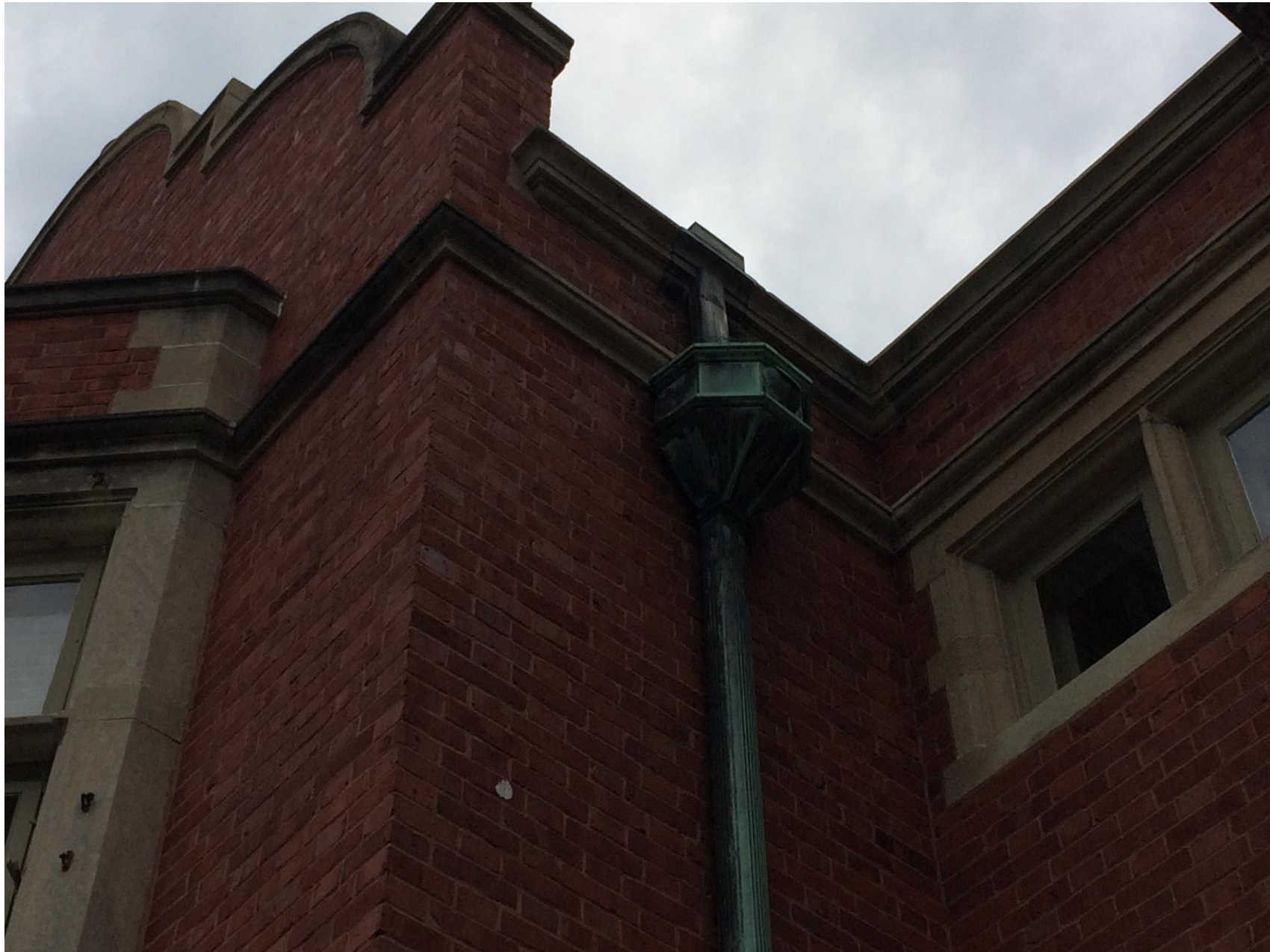
One of the gutters to be replaced. Catch basin is not to be removed.