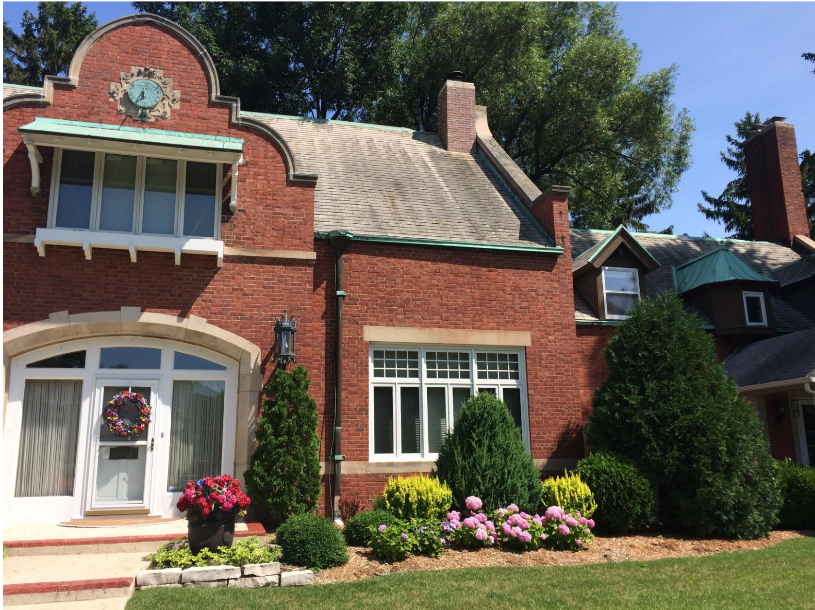
3422 N Lake gutters