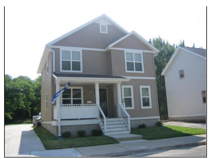
2008 "Willow" Model