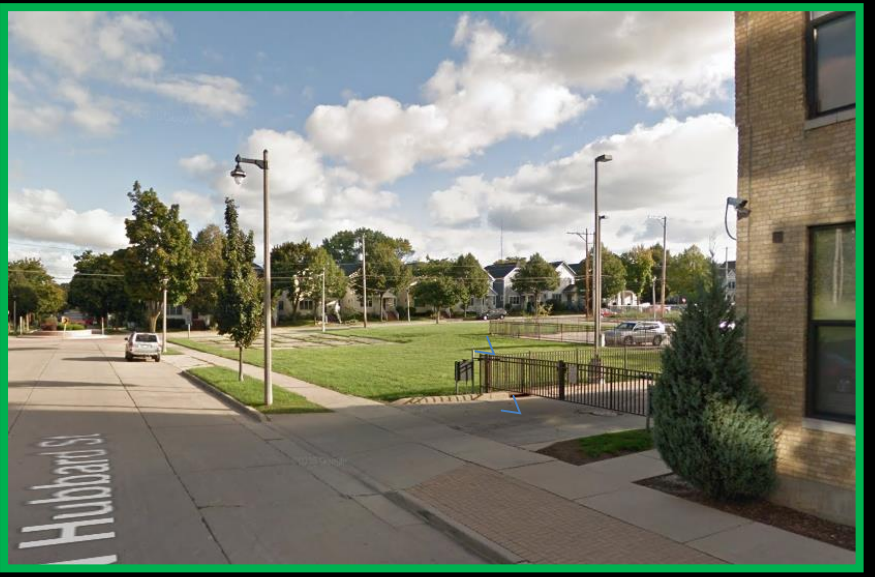
View from North Hubbard Street, looking northeast