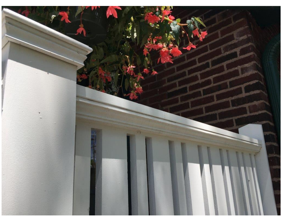
Examples of rail type to be used.