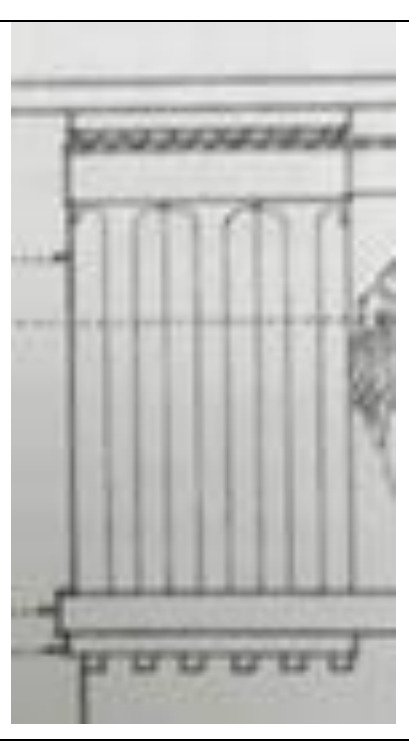
Typical triglyph as used on porch frieze