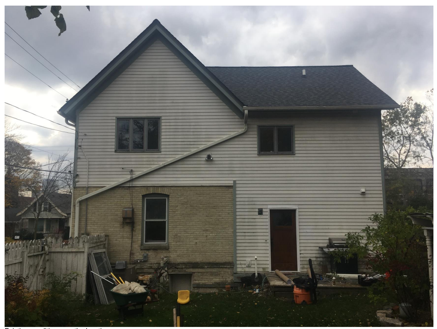
Existing conditions, north elevation