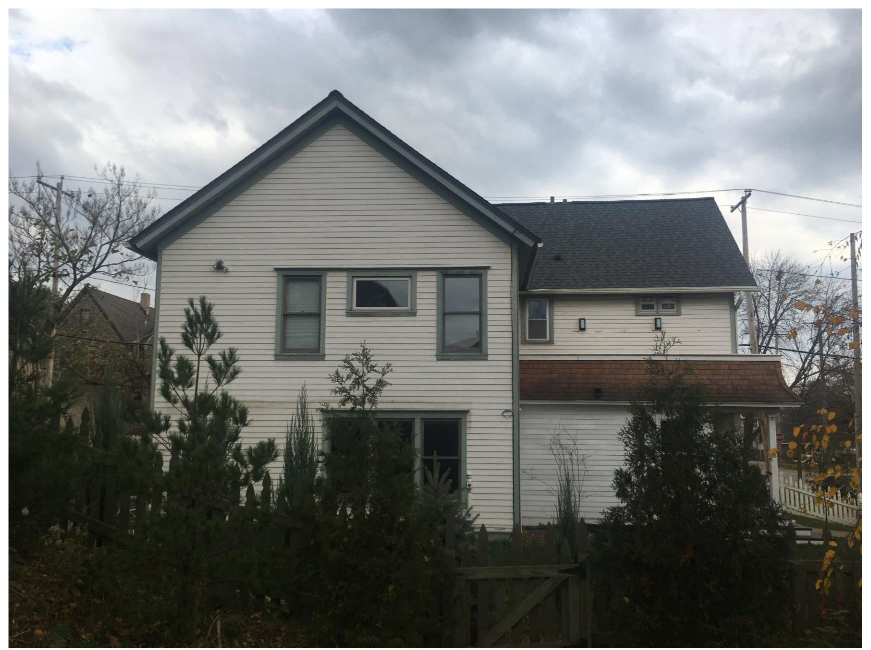
Existing conditions west elevation