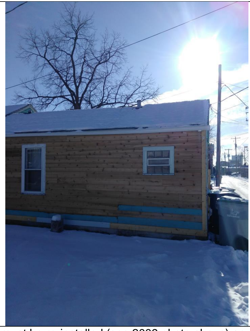
Current north elevation conditions, small square window must be re-installed (see 2009 photo above) and glass block window must be removed.