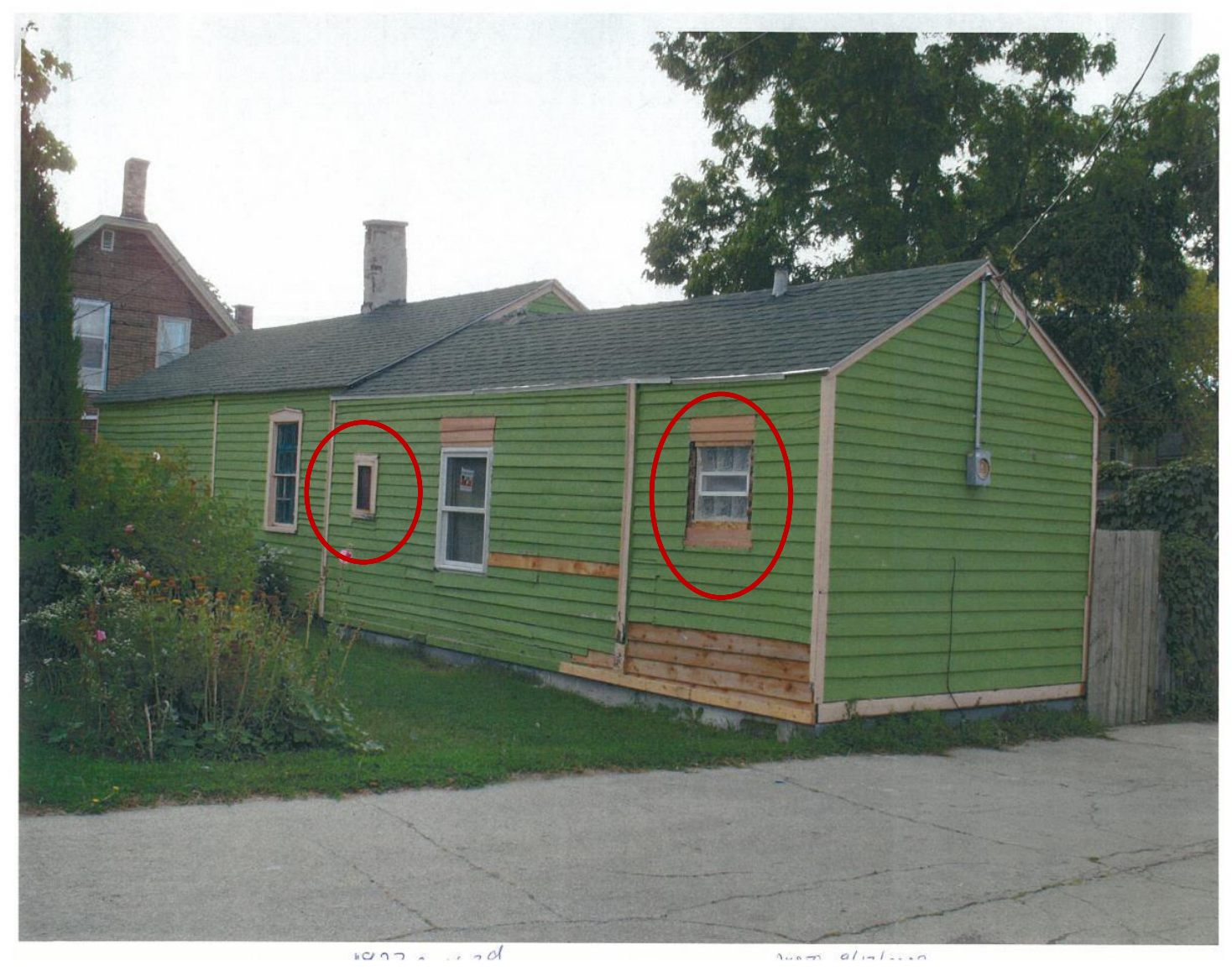
Rear (north) in 2009. Circled window at left (east) must be re-installed in shwown location. Circled glass block window at right (west) block window must be removed. A new application is required to replace this window though it may be sided over without further approval.