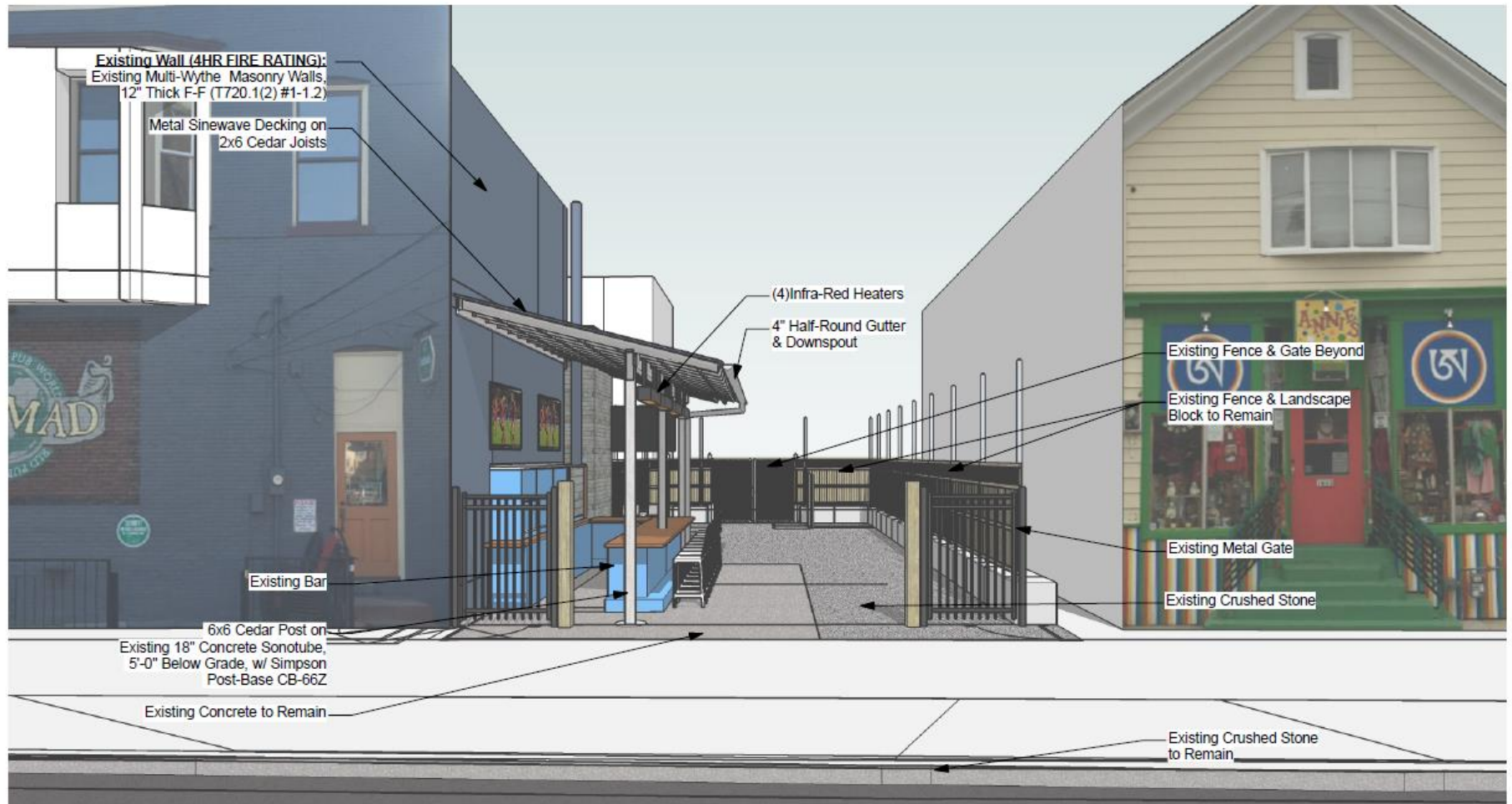
1 BACK BAR CANOPY - FROM WARREN AVE (LOOKING EAST)