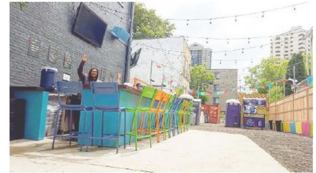
From E. Warren Ave, Looking East