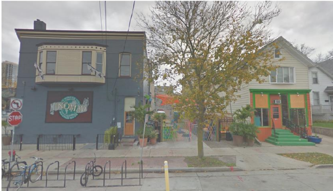
From E. Warren Ave, Looking East