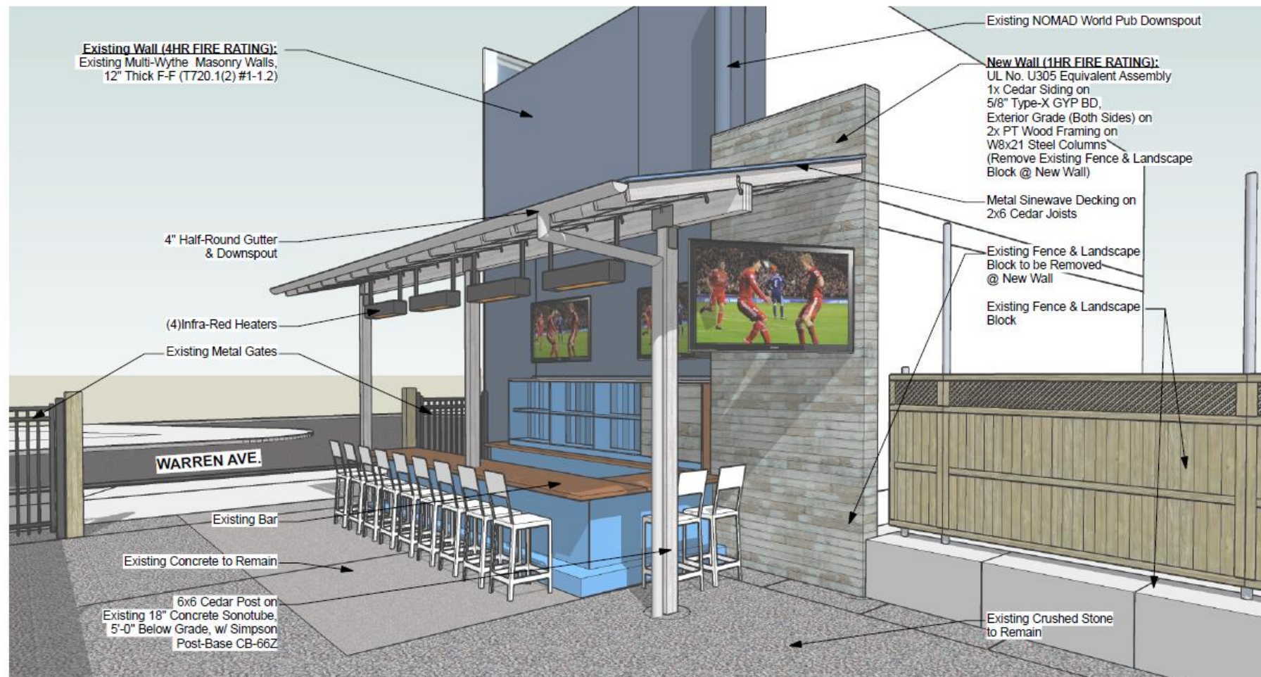
1 BACK BAR CANOPY - FROM BEERGARDEN (LOOKING WEST)