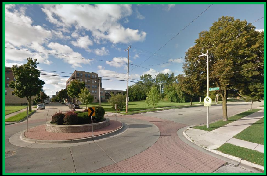
View from East Brown and North Hubbard Streets

View from North Palmer Street, looking northeast