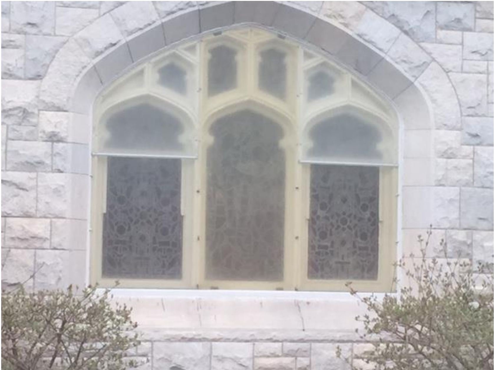
Detail of typical existing storm with heavily damaged Lexan-type material.