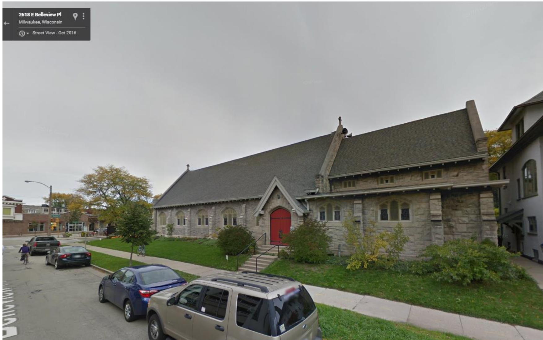
Existing conditions, Bellevue façade