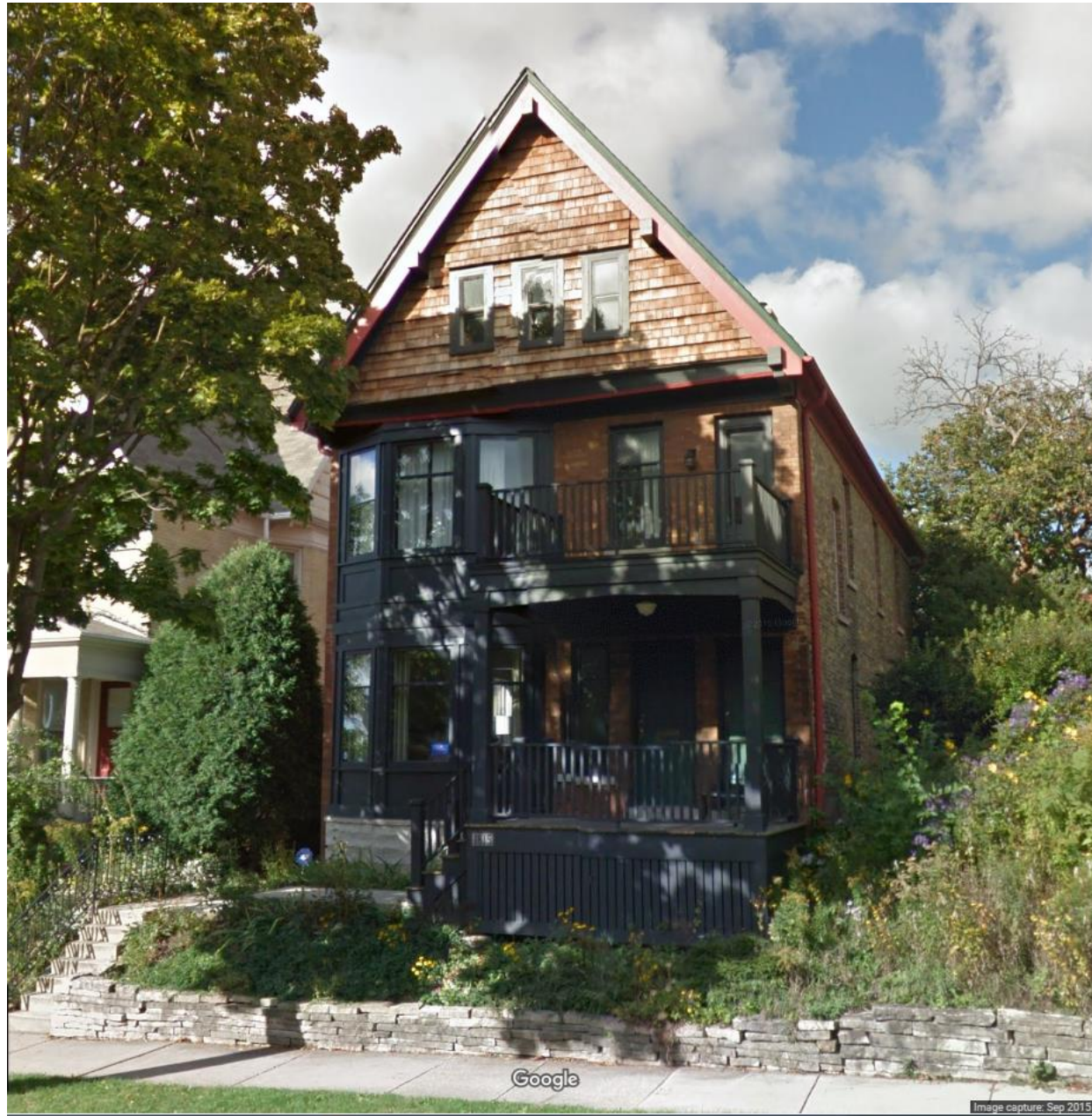
Current conditions at front.