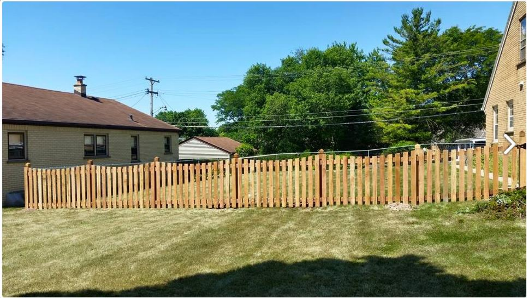
Approved fence type. Must be painted at completion.