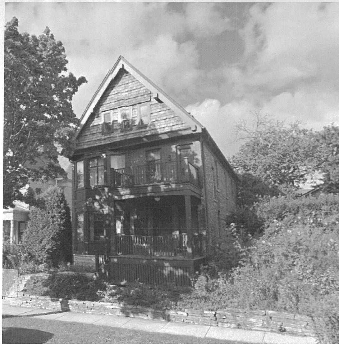
1815 North 2 nd Street