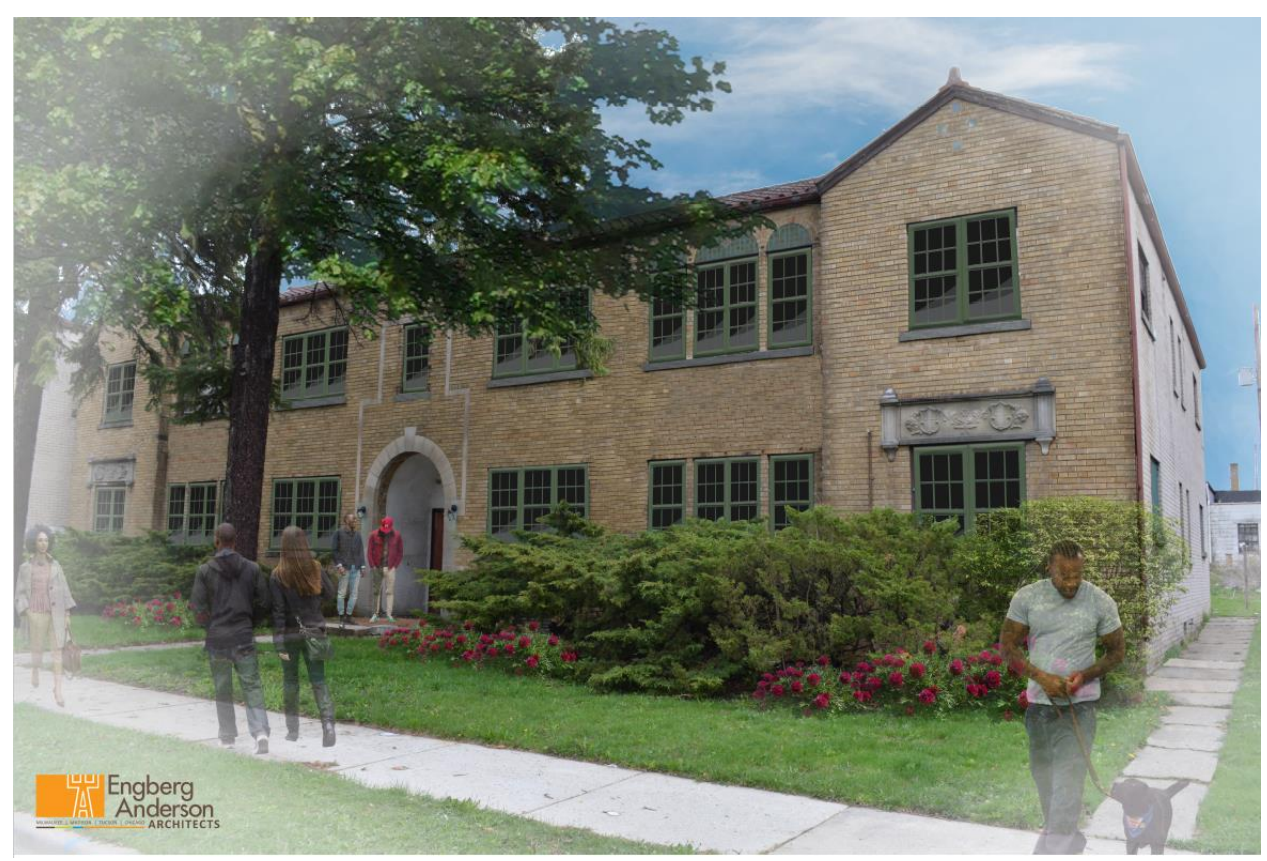
CITY MULTI-FAMILY PROPERTY AFTER RENOVATIONS

Certain City approvals may be required in addition to the approval of the Land Disposition Report. Closing is contingent upon the Buyer obtaining all necessary approvals, financing and DCD's approval of the final building elevations.