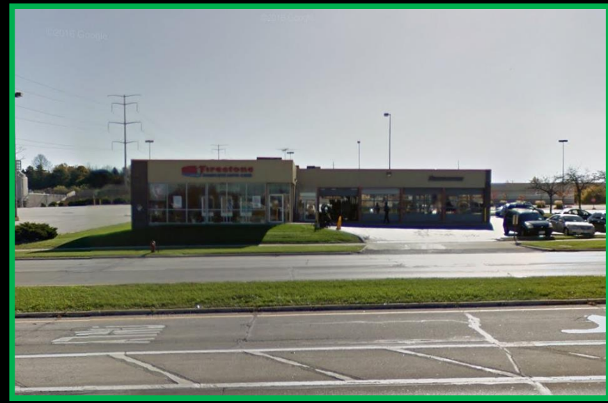
View from West Brown Deer Road, looking south