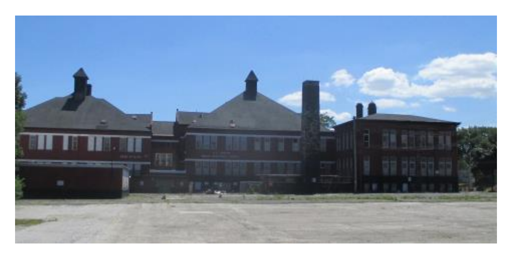
2001 West Vliet Street: North Elevation

The Property was fire damaged in November of 2013 and has not been occupied since that time. A condemnation order was issued by the Department of Neighborhood Services. The site has fallen into disrepair and requires significant renovation as well as environmental remediation. The Wisconsin Department of Natural Resources identified multiple hazards within the building and confirmed that entry should not occur to the Property until the hazards are contained and/or removed. The Department of City Development ("DCD") has been working with the U.S. Environmental Protection Agency ("EPA") and a contractor of the EPA since April of 2017 to remediate environmental hazards within the building on the Property. Due to the raze order on the premises and the significant environmental concerns, the Property poses significant redevelopment challenges.