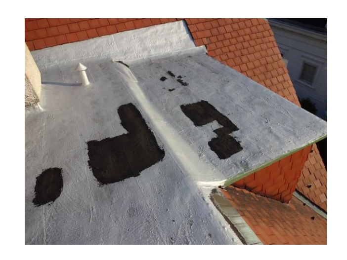
Facing South East

Flat Roof: South Side: Black areas indicate patches for former leaks.