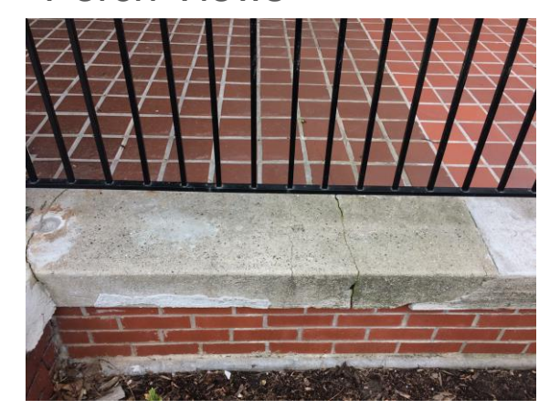
Close up of seam between old and new concrete crumbling mortar