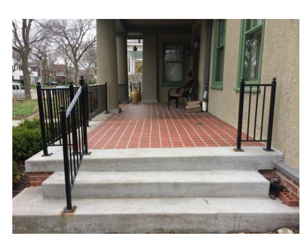
Full porch view