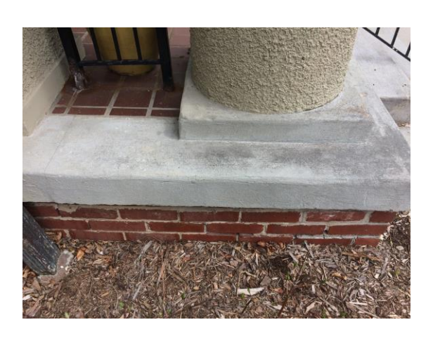
Close up of south face of south