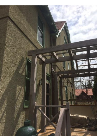
West Face North Face