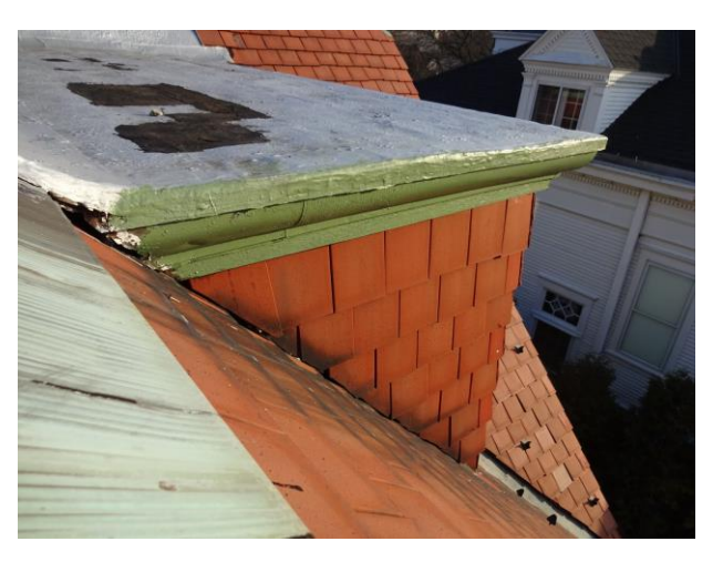
Facing South East