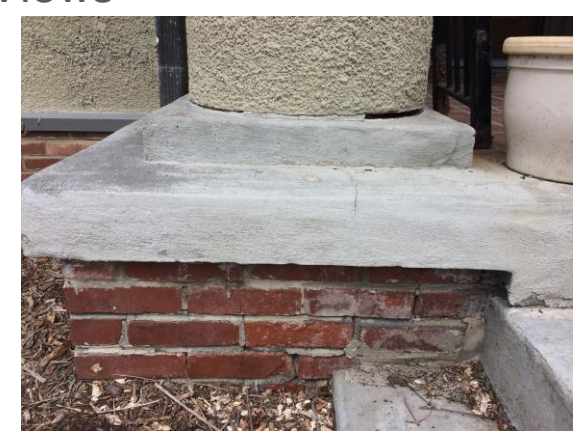
Close up of east face of south porch column, porch Brick facing and crumbling mortar crumbling mortar