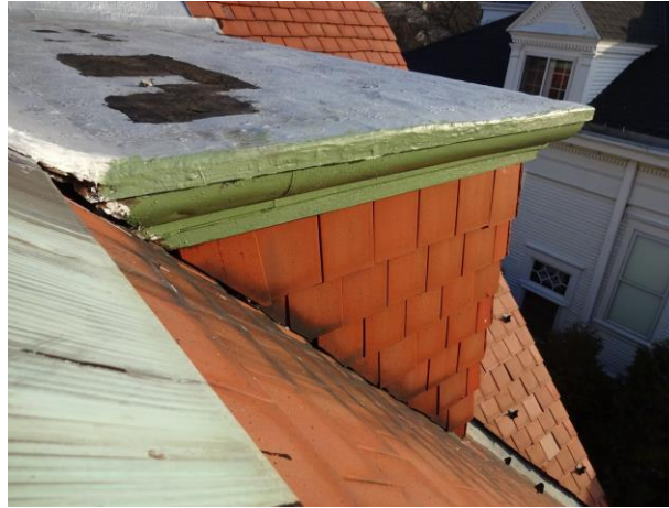
Facing South East