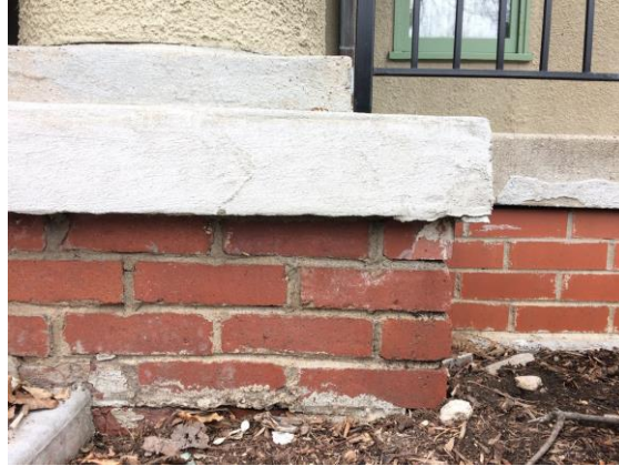
Close ups of old and new brick facing, failing patched concrete, and