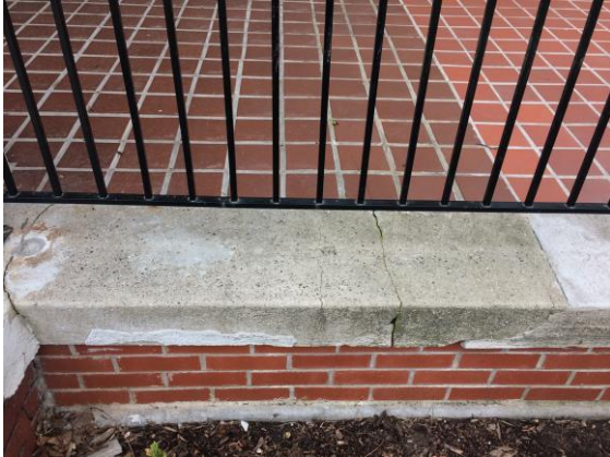
Close up of seam between old and new concrete crumbling mortar