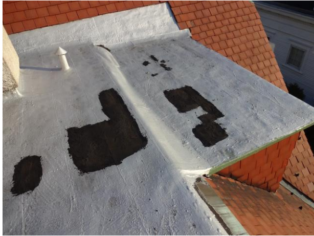
Facing South East

Flat Roof: South Side: Black areas indicate patches for former leaks.