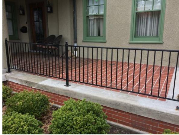
Only a portion of the the brick