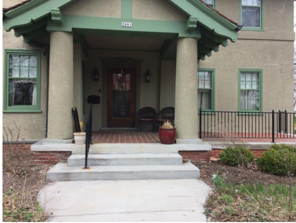
Full porch view