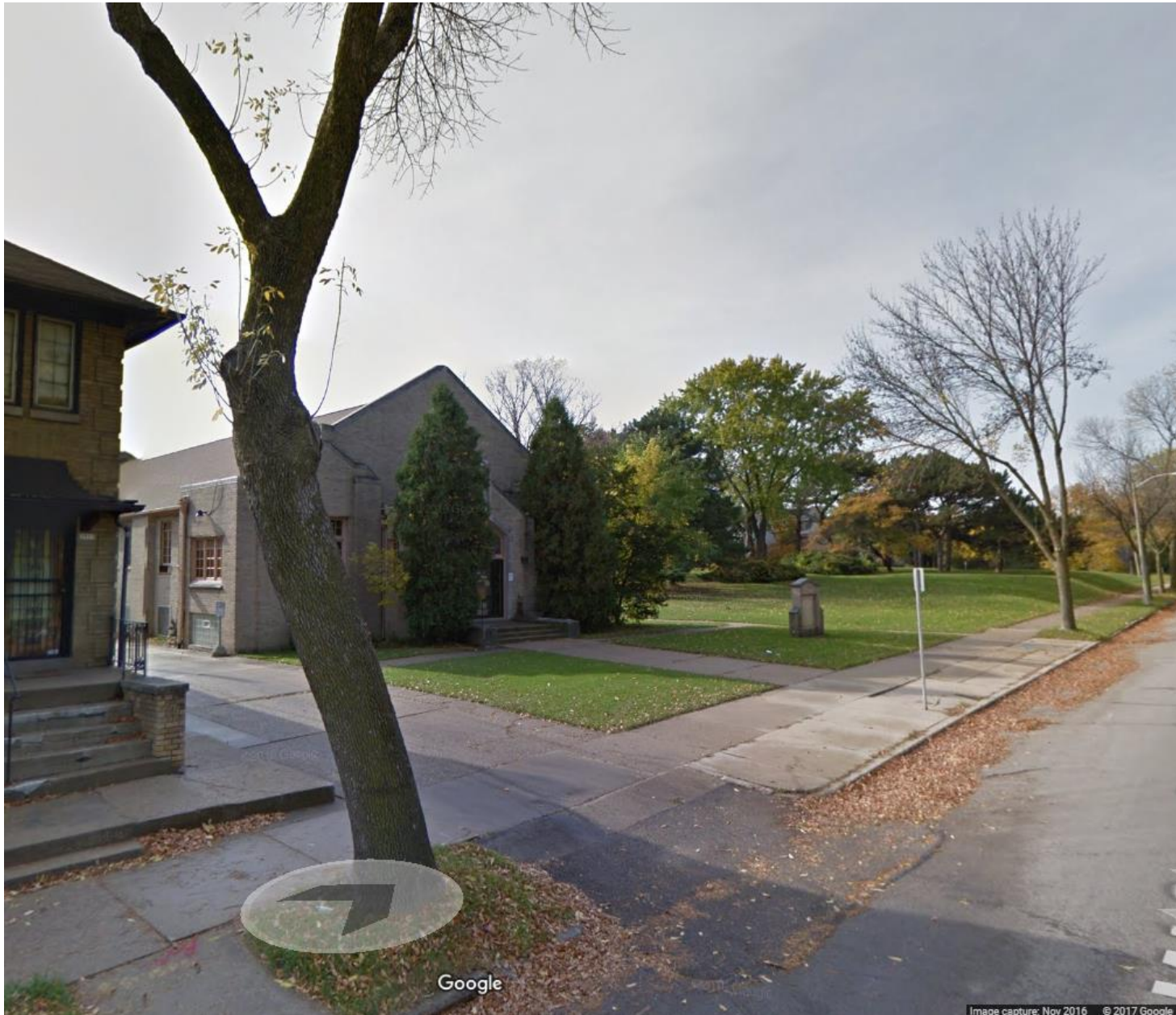
Current conditions, looking southwest