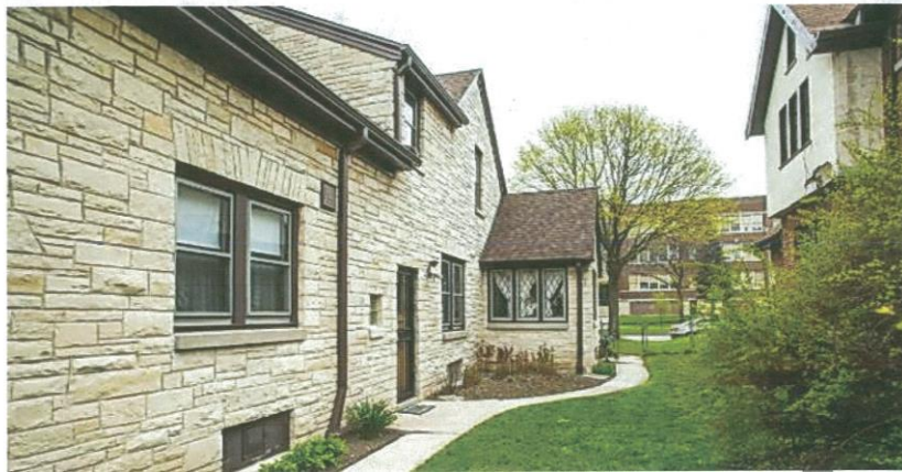
View of yard from approximate location of deck looking towards Sherman Boulevard