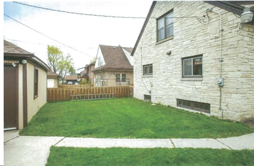
View of back yard