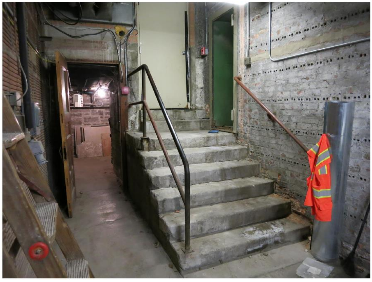
Interior conditions. Door is notably not weather tight.