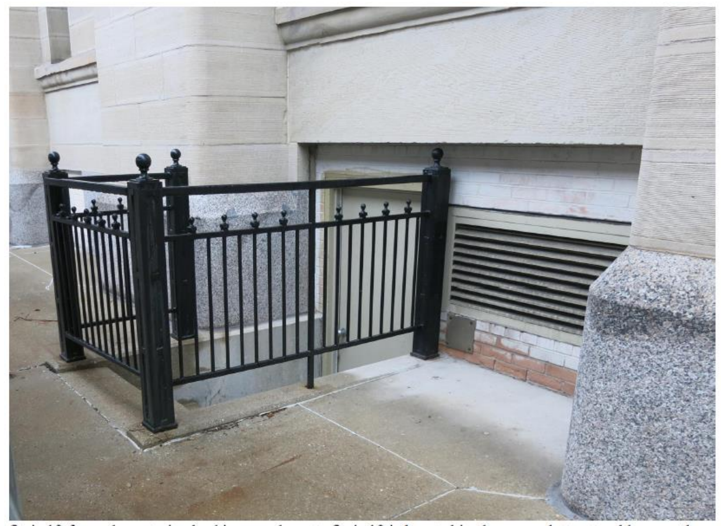
Stair 10 from the exterior looking southwest. Stair 10 is located in the second structural bay north of the tower. The plan below shows the location of the stair in the basement of City Hall. The basement plan is the preconstruction layout of the building.