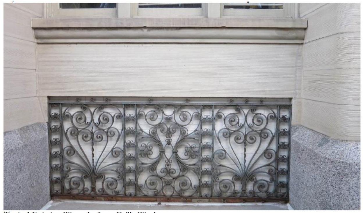
Area will be infilled to match this infill panel nearby.