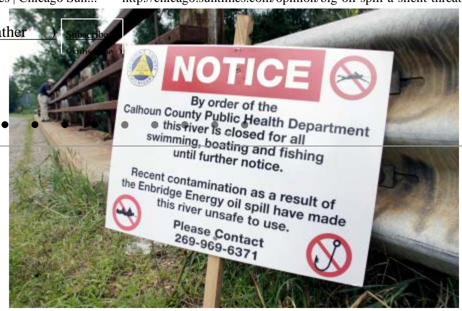
A sign is posted on a bridge to indicate water contamination after an oil spill of approximately 800,000 gallons of crude in the Kalamazoo River July 28, 2010 in Marshall, Michigan.

An advisory board in Michigan, which has regulatory authority over the pipeline, is assessing the risks of the pipeline and weighing alternatives. A draft report is scheduled to be released this summer.