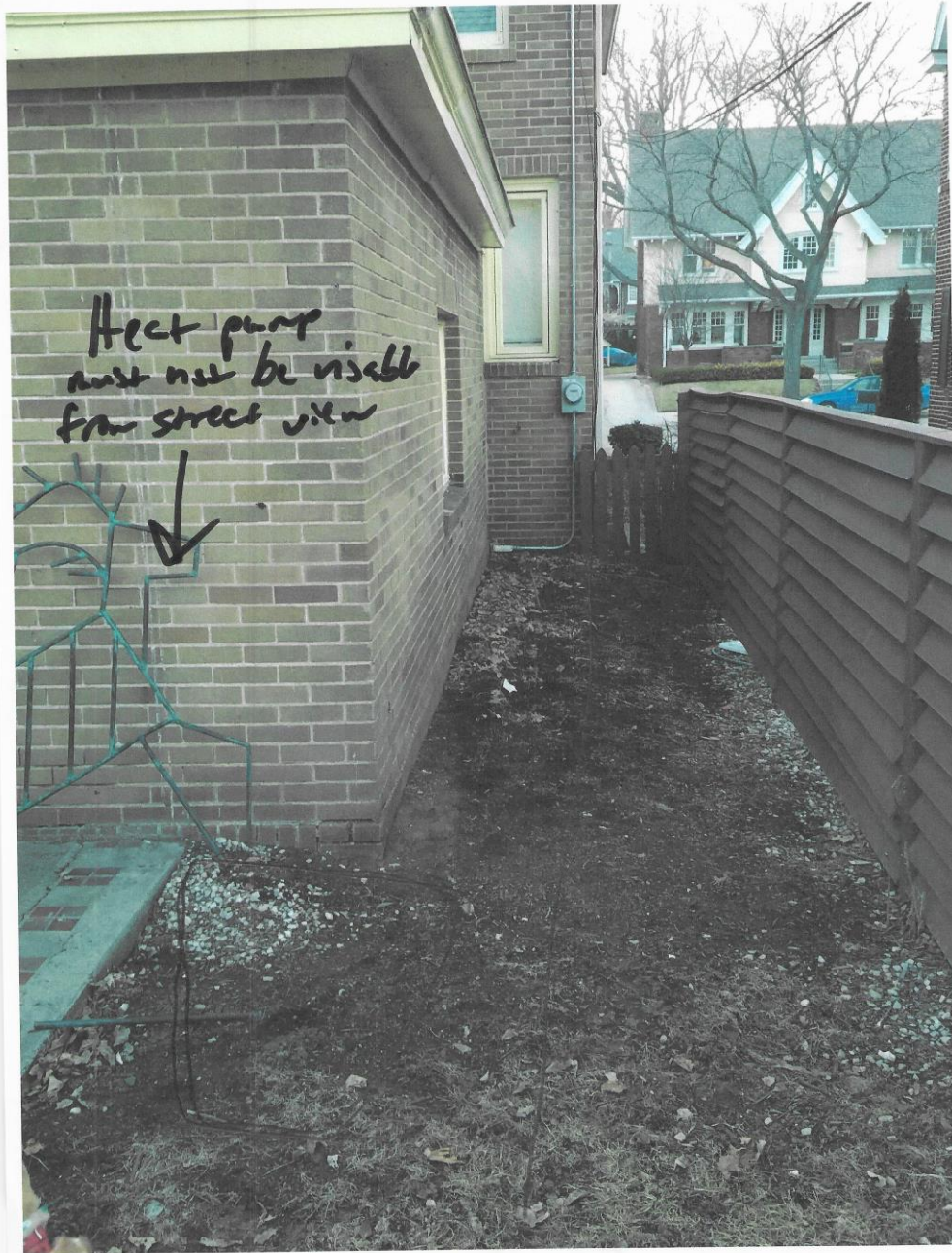
Installation location of heat pump in rear yard behind rear wing.