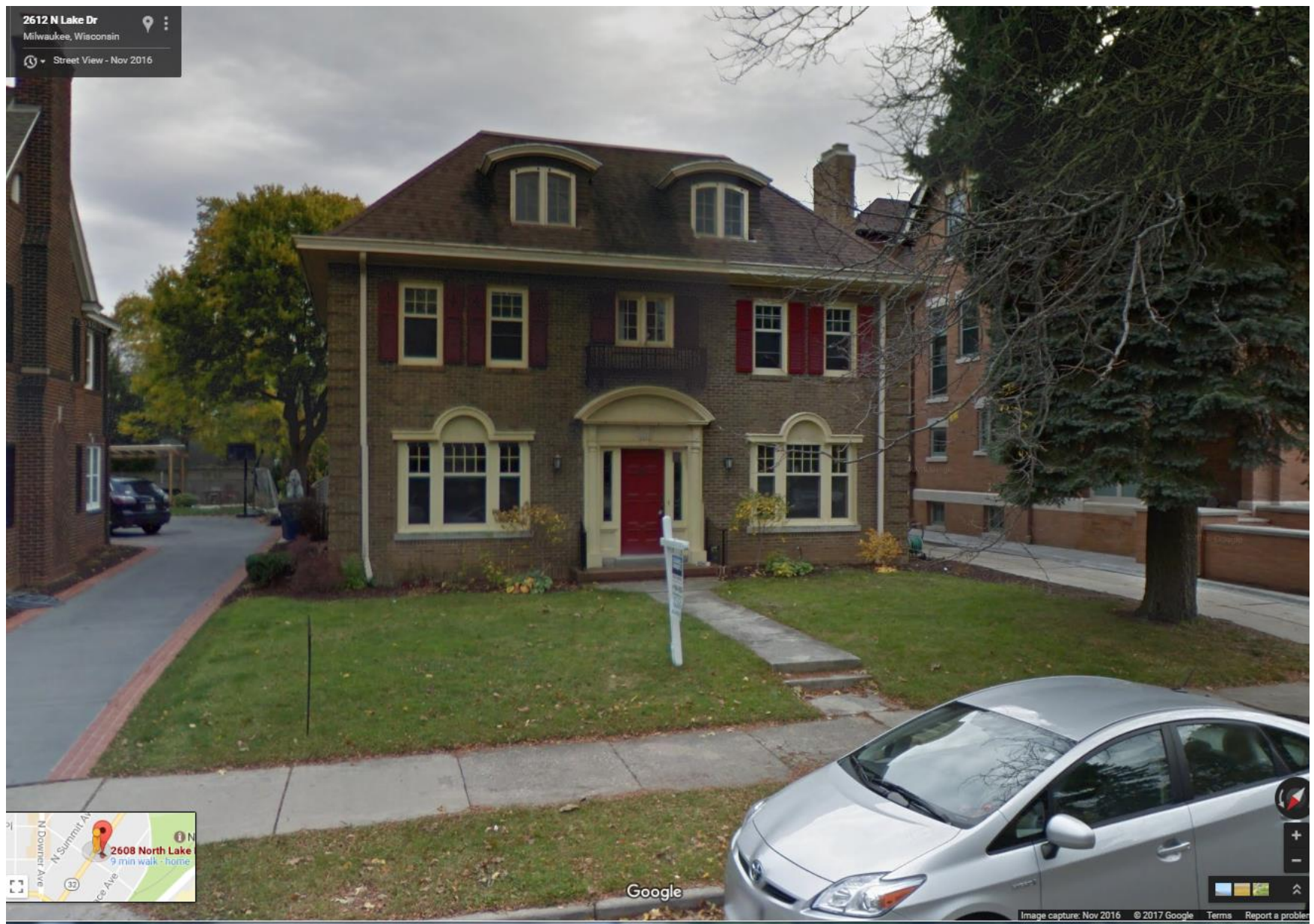
Current front conditions