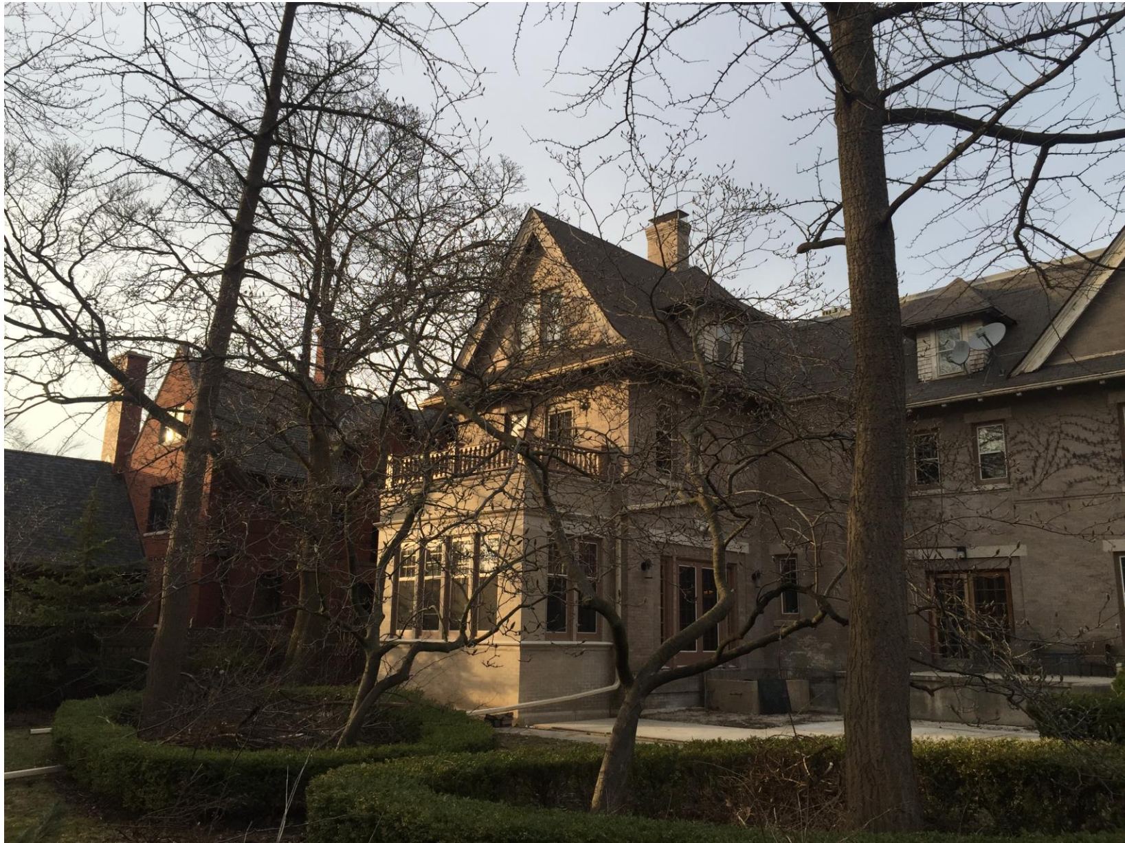
Remove gingko trees in this photograph