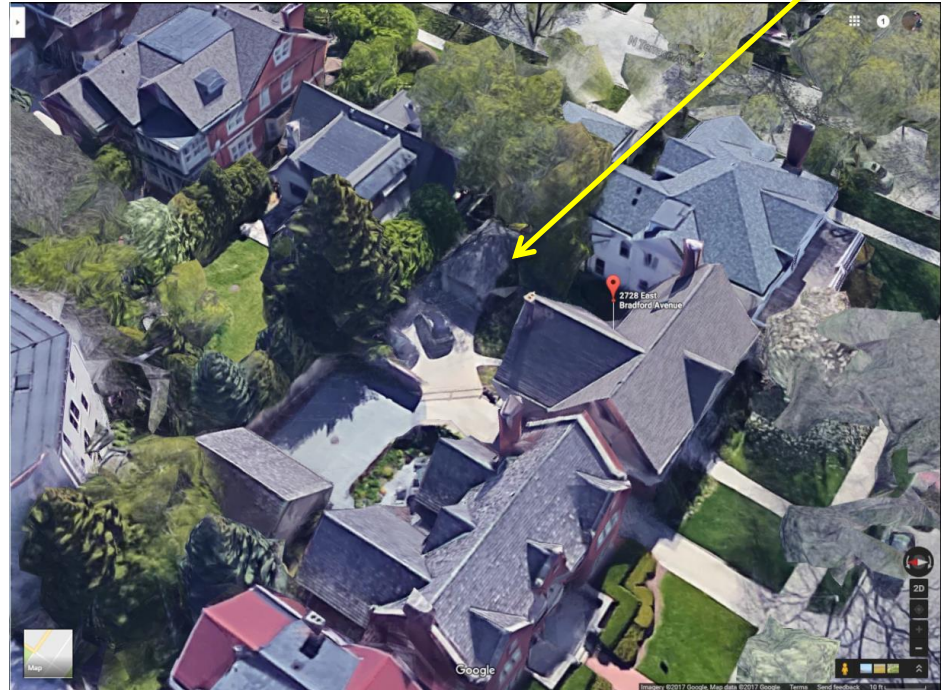
Garage location on lot. This garage is approved for demolition