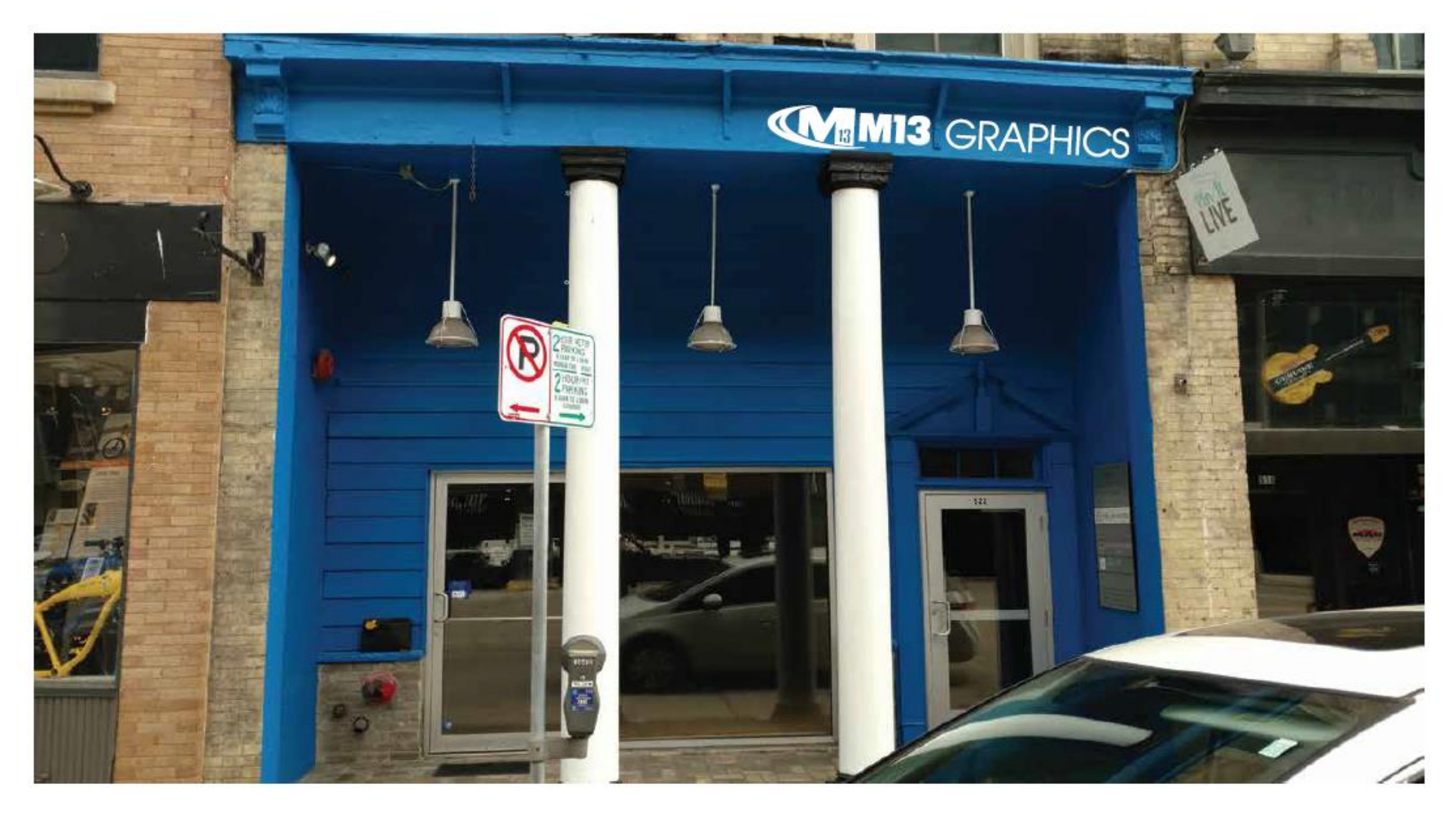
Mockup of final appearance. Frieze sign will be 2" thick acrylic material and not flush or painted as shown. UNPAINTED BRICK MUST REMAIN UNPAINTED.