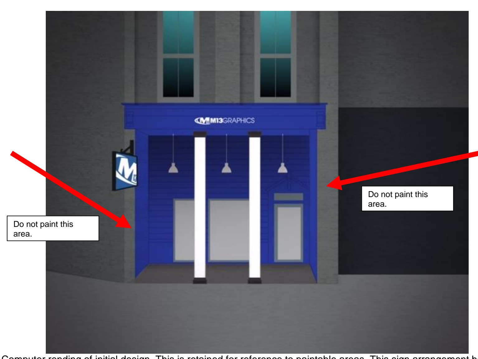
Computer rending of initial design. This is retained for reference to paintable areas. This sign arrangement has been withdrawn by the applicant.