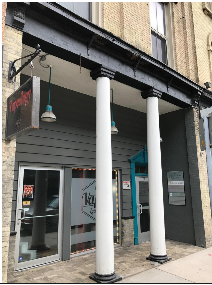
Existing conditions. Subject building has columns in front of a recessed storefront