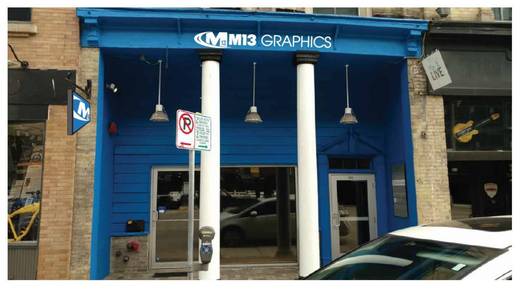
<u>Updated rendering dated 4/3/17.</u> The hanging sign at left has been removed from the building and is no longer included in this COA.