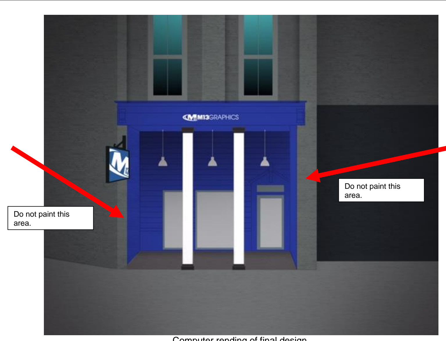
Computer rending of final design.