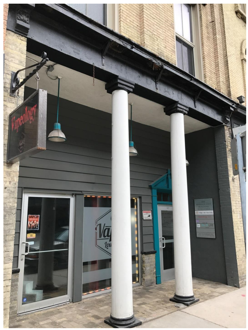
Existing storefront detail