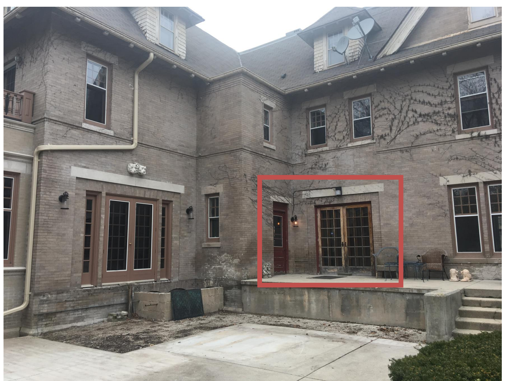
Expanded rear view. Highlighted screen doors to be replaced. Metal security doors shall match the grid pattern of the highlighted French doors.