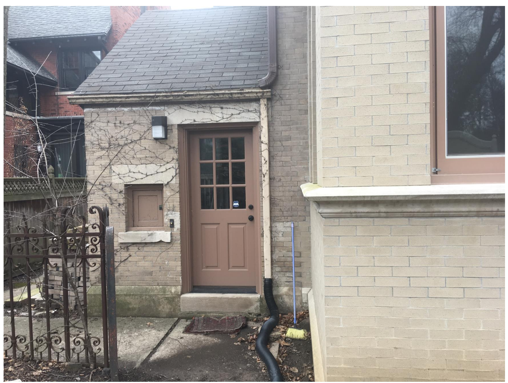
Security door to be installed in front of this rear door as well.