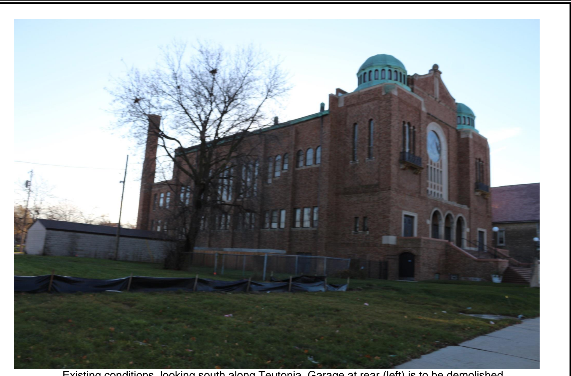
Existing conditions, looking south along Teutonia. Garage at rear (left) is to be demolished.