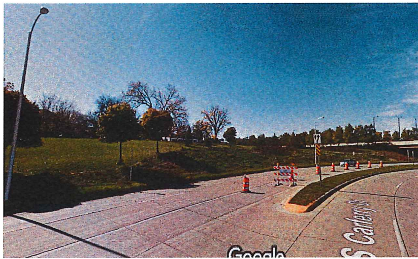
VIEW OF PROPERTY LOOKING SOUTHWEST FROM SOUTH CARFERRY DRIVE