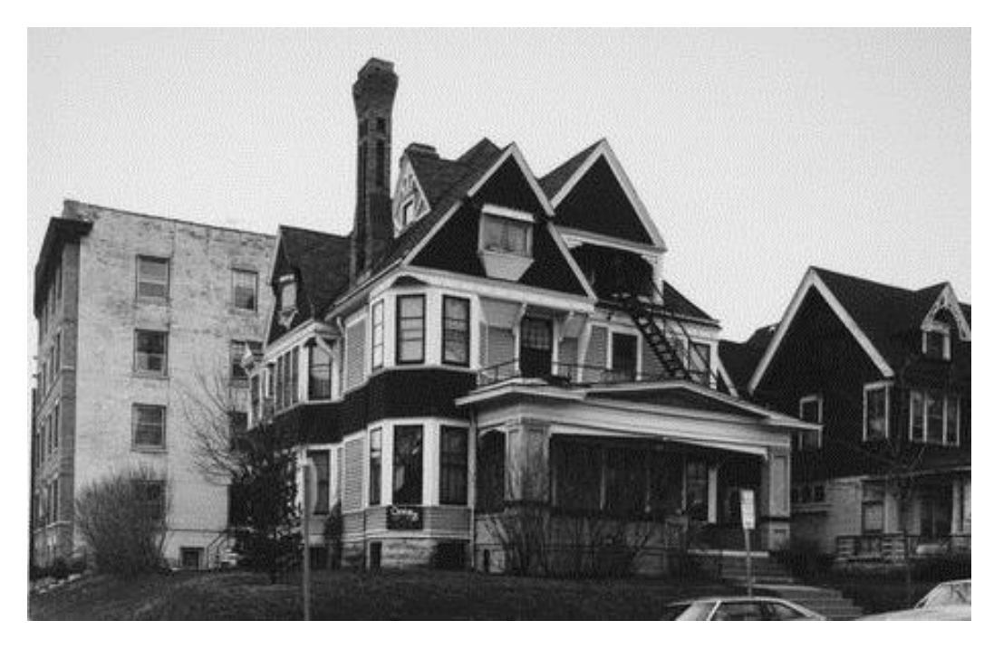
Survey Photo 1984