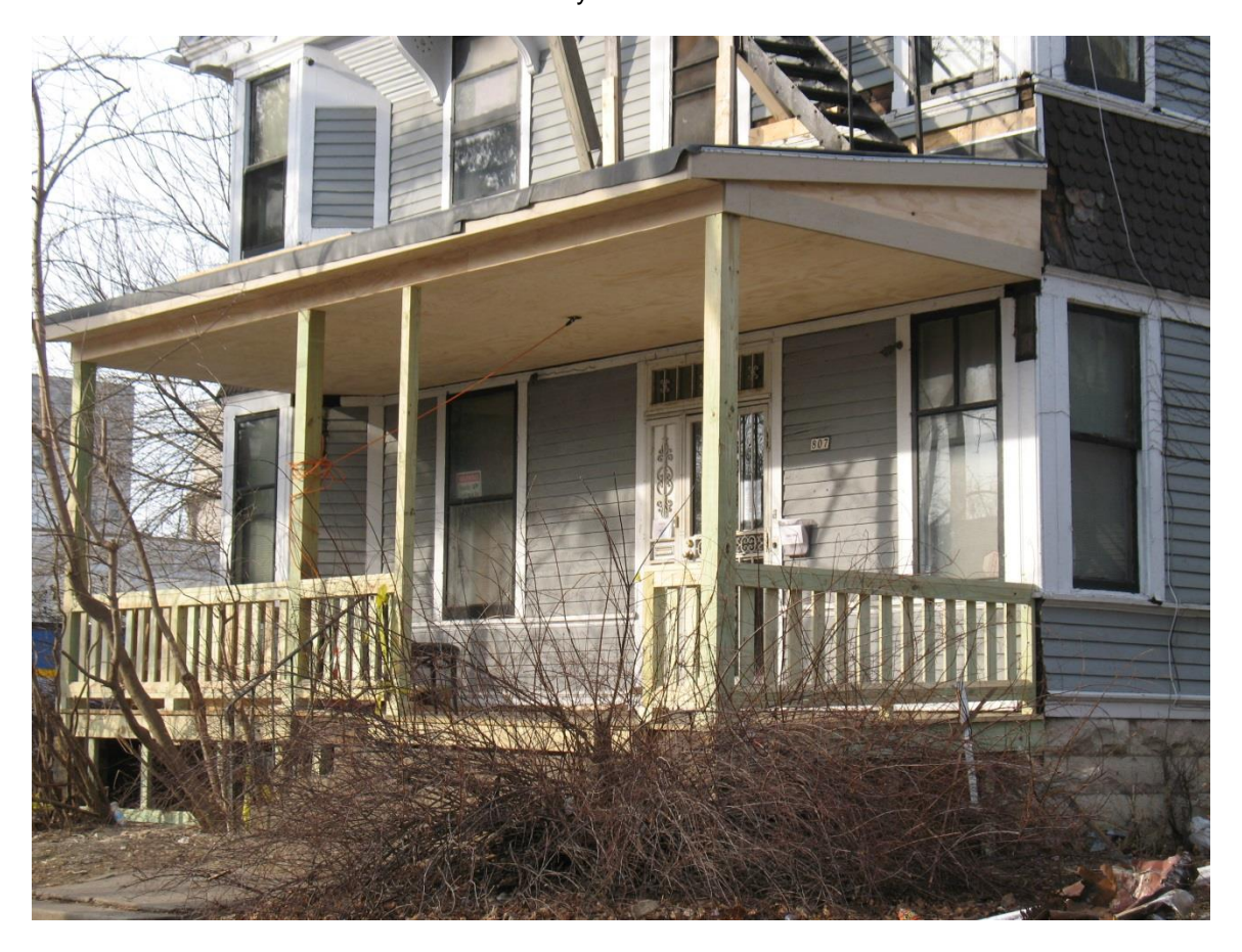
Newly constructed porch 2017