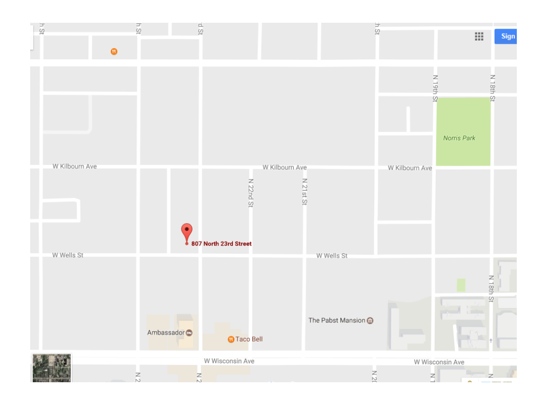
Google Map 807 North 23rd Street