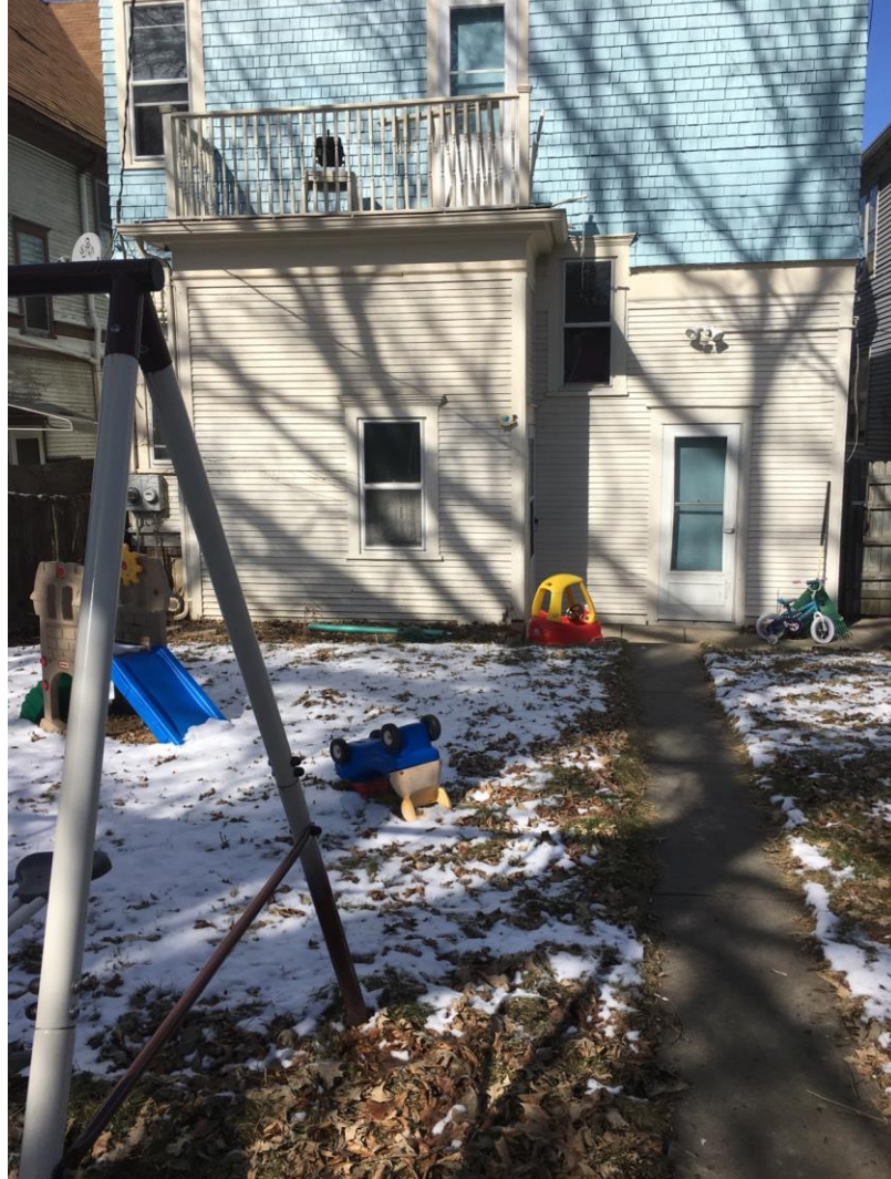
Current Conditions Front