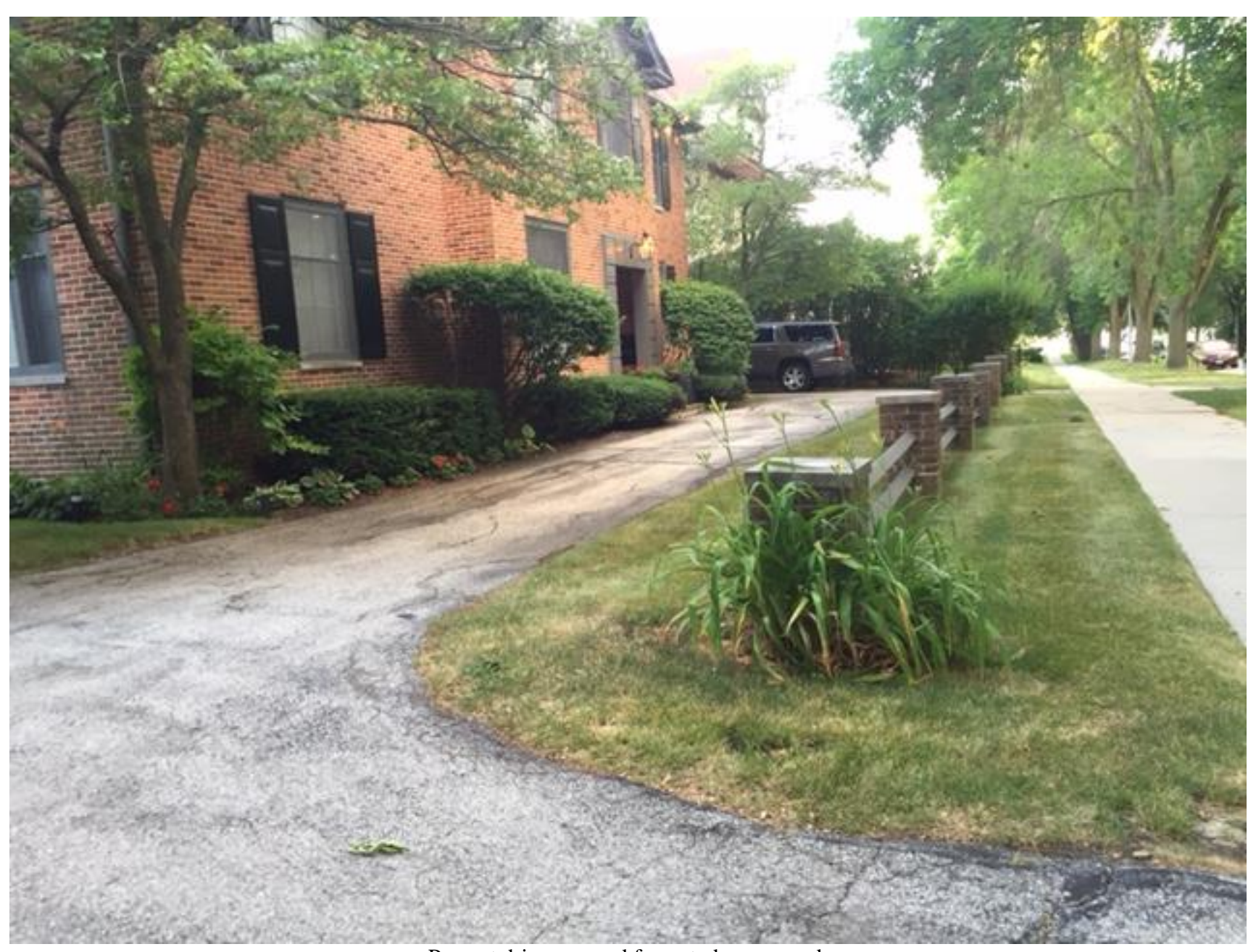
Present driveway and fence to be removed.