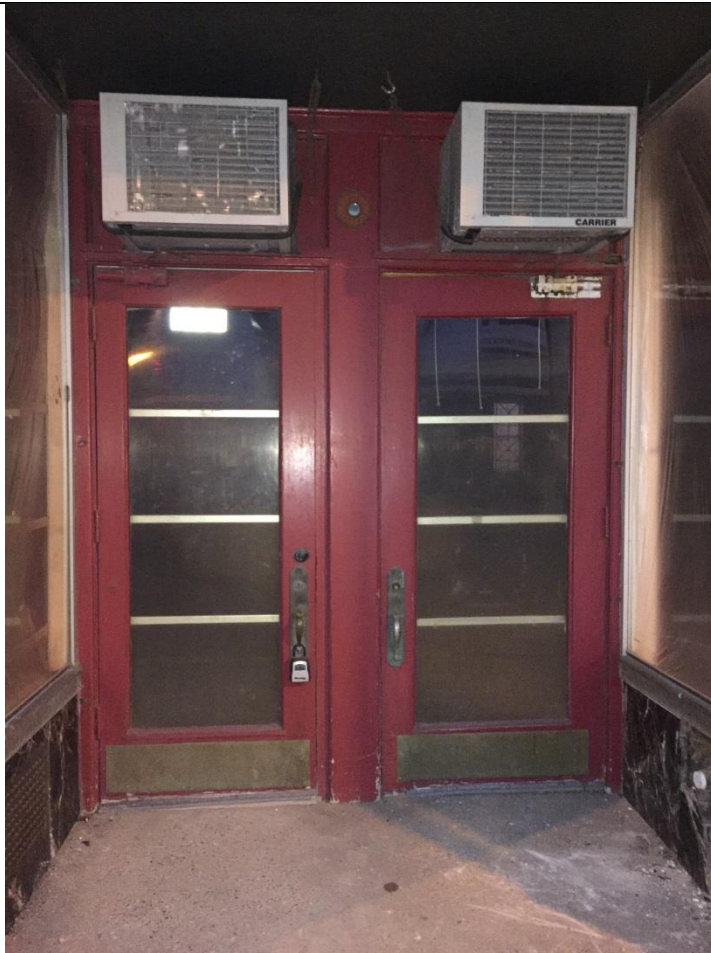
Doors, existing conditions exterior. Handles are to be retained, but doors and transoms are to be replaced. Center dividing column shall remain.