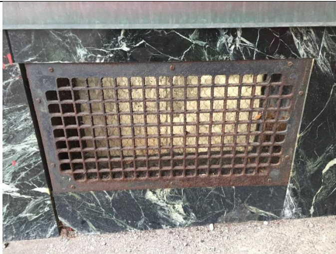
Grille at south side of entry recess to be replaced