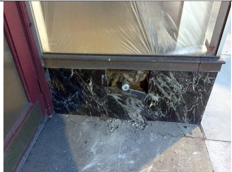
Broken marble to be hidden with new grille.