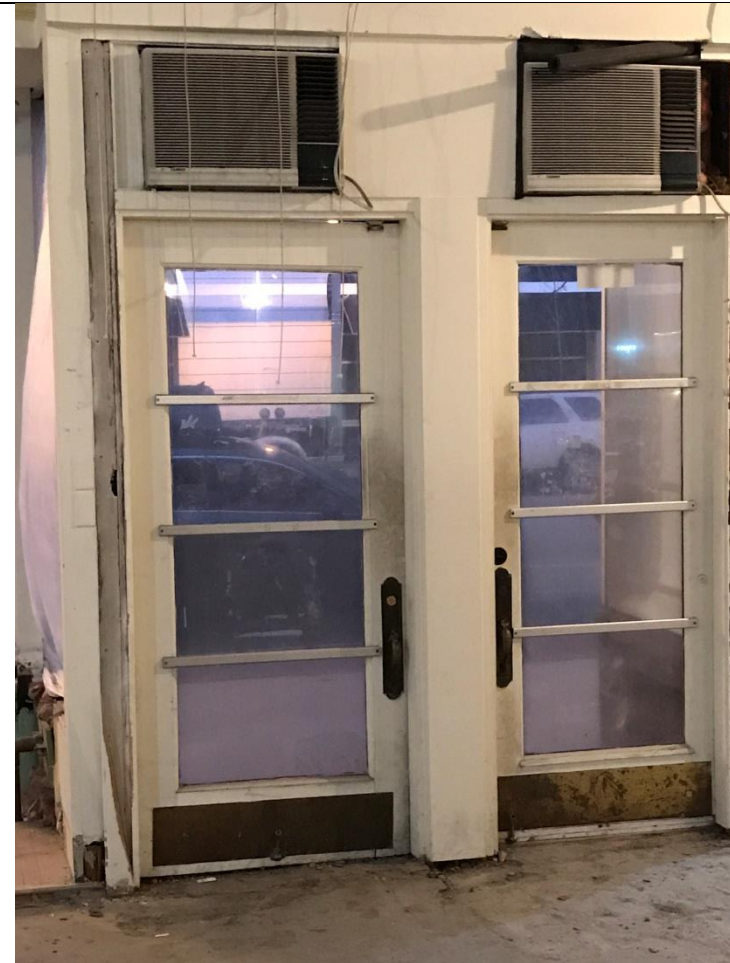
Doors, existing conditions interior. Handles are to be retained, but doors and transoms are to be replaced. Center dividing column shall remain.