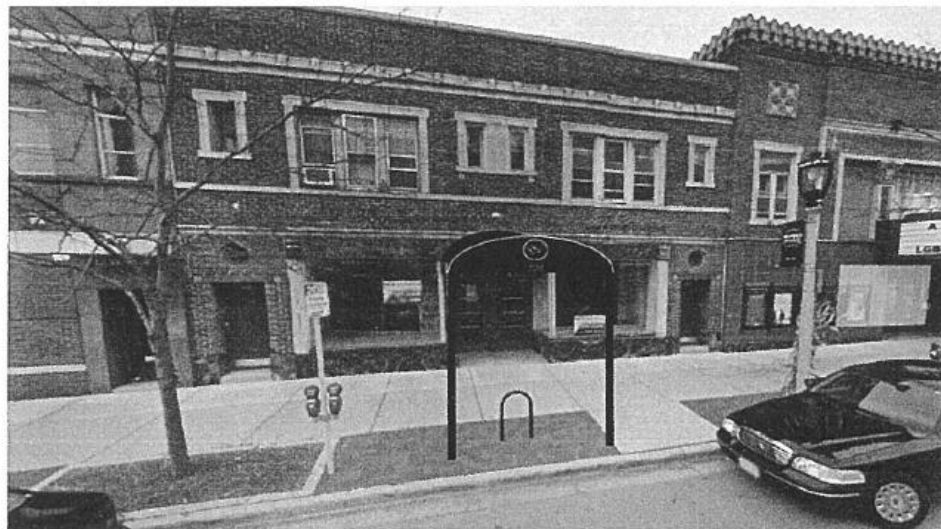
Canopy details with view of installation. Dimensions as proposed or smaller.