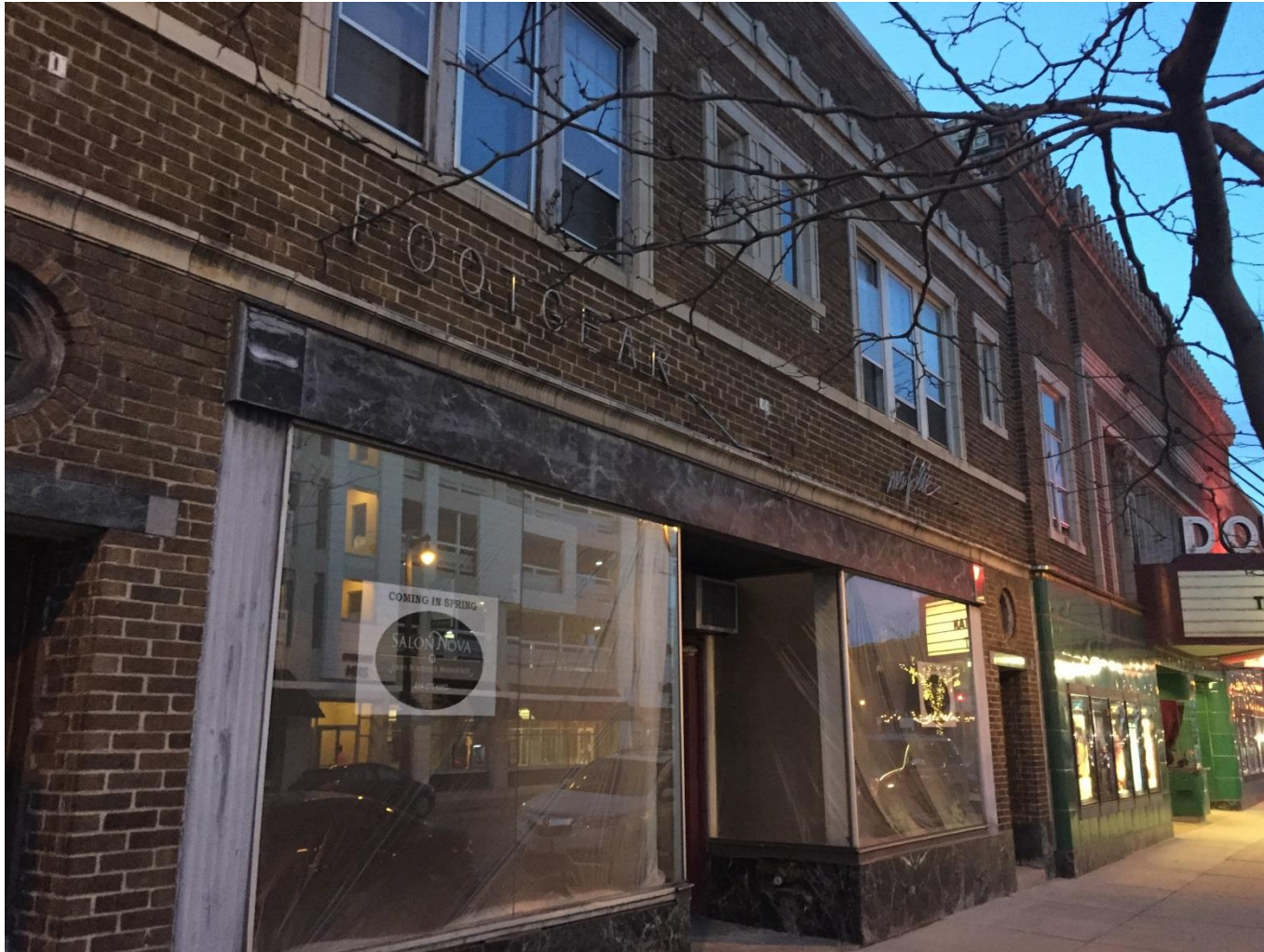
Existing conditions, Feb. 2017.