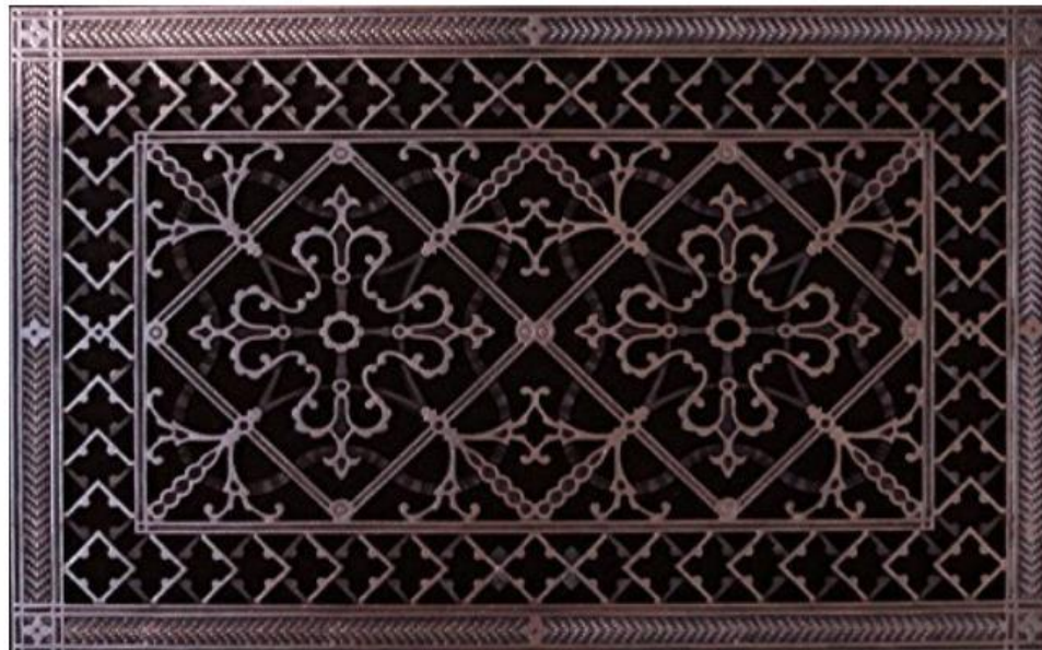
Replacement grille design for both openings in the storefront recess.