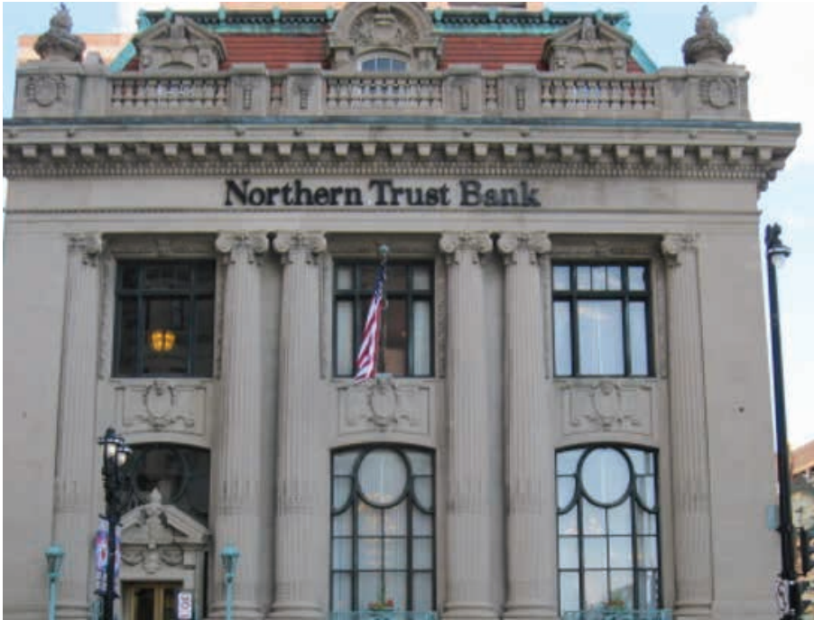
Existing conditions - NTS

[B] - MOUNTING PAN Description: Fabricated aluminum Color: Paint to match building facade [TBD]