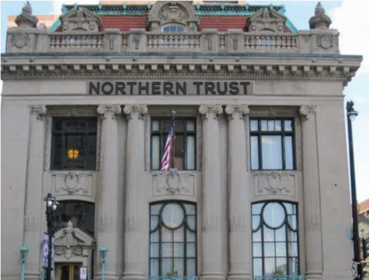
Proposed signage (south elevation) - NTS