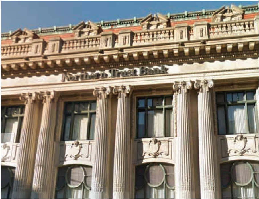
Existing conditions - NTS

Description: Fabricated aluminum Color: Paint to match building facade [TBD]