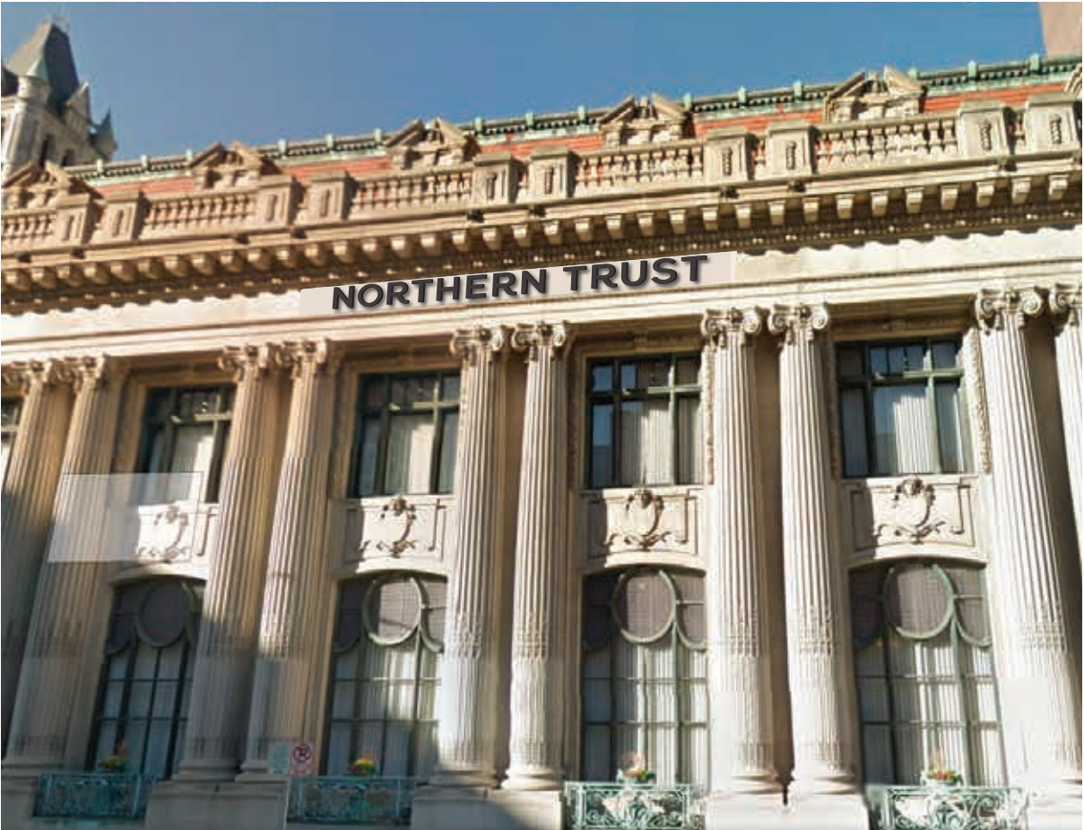
Proposed signage (east elevation) - NTS