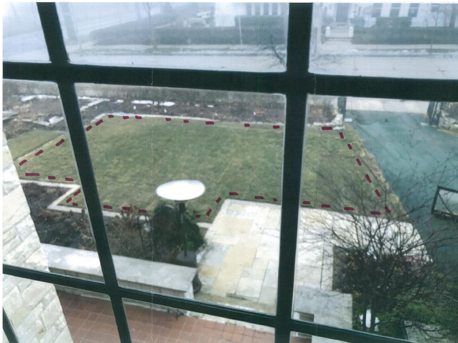
Aerial view of proposed fence location