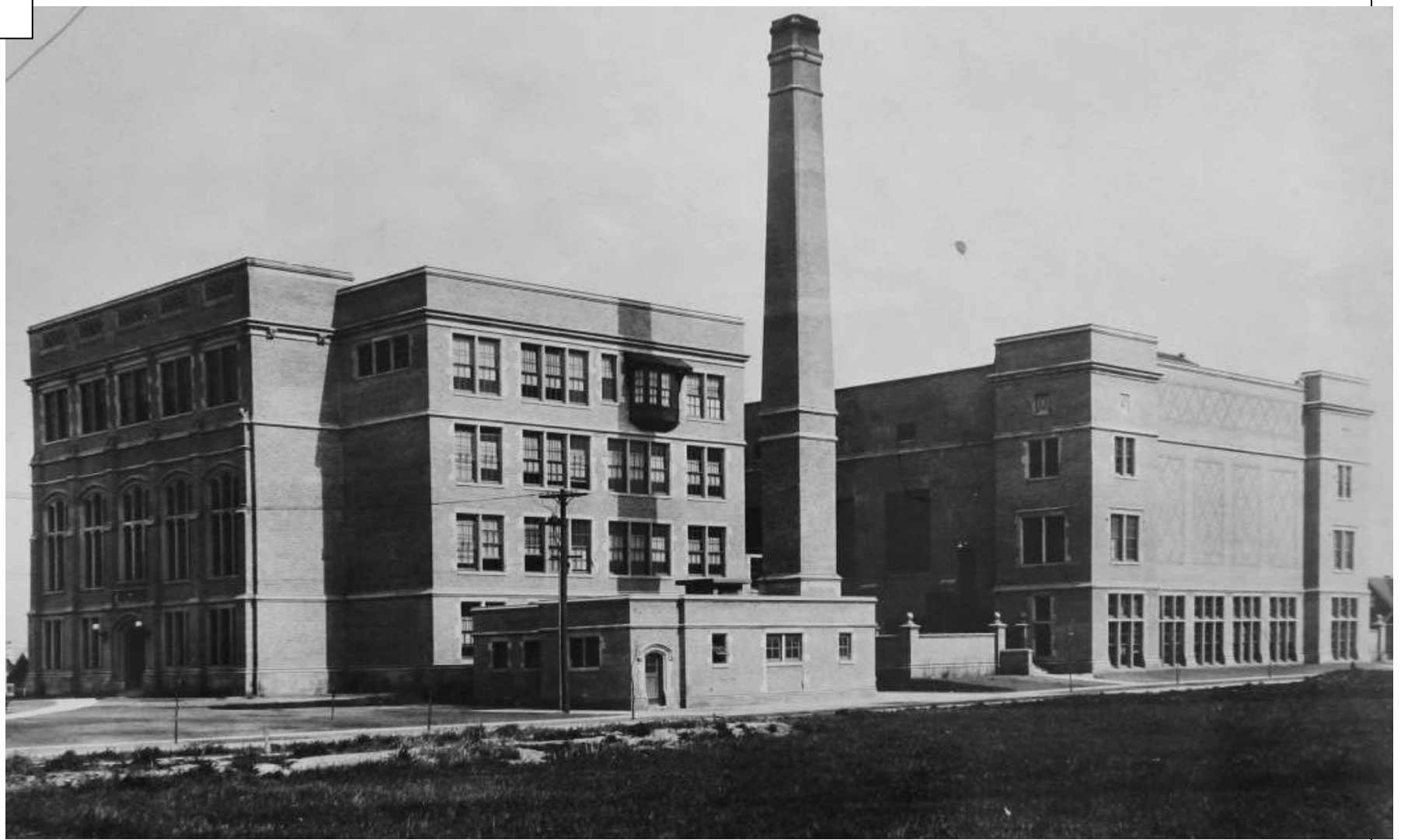
Historic view of west elevation with power plant and chimney