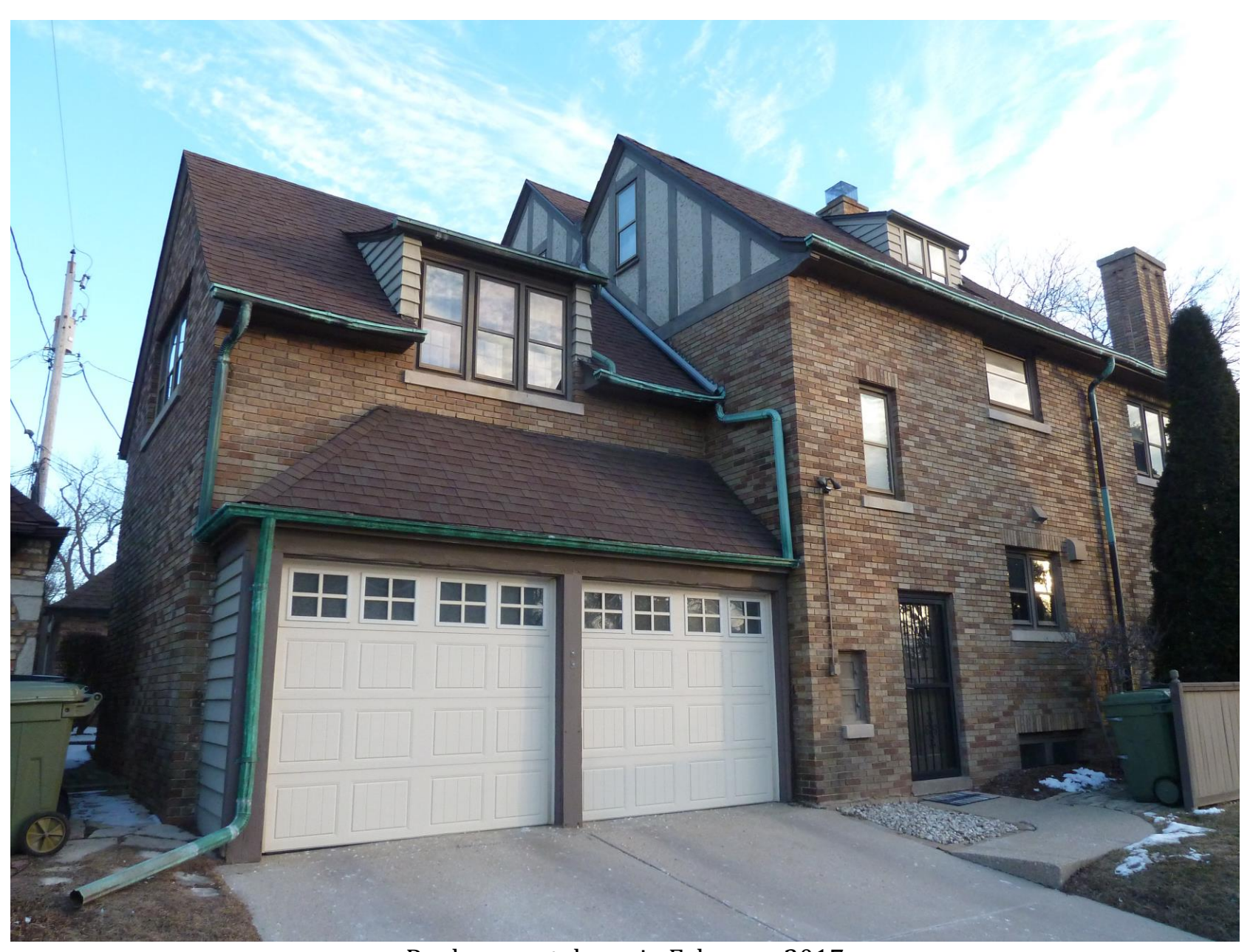
Replacement doors in February 2017