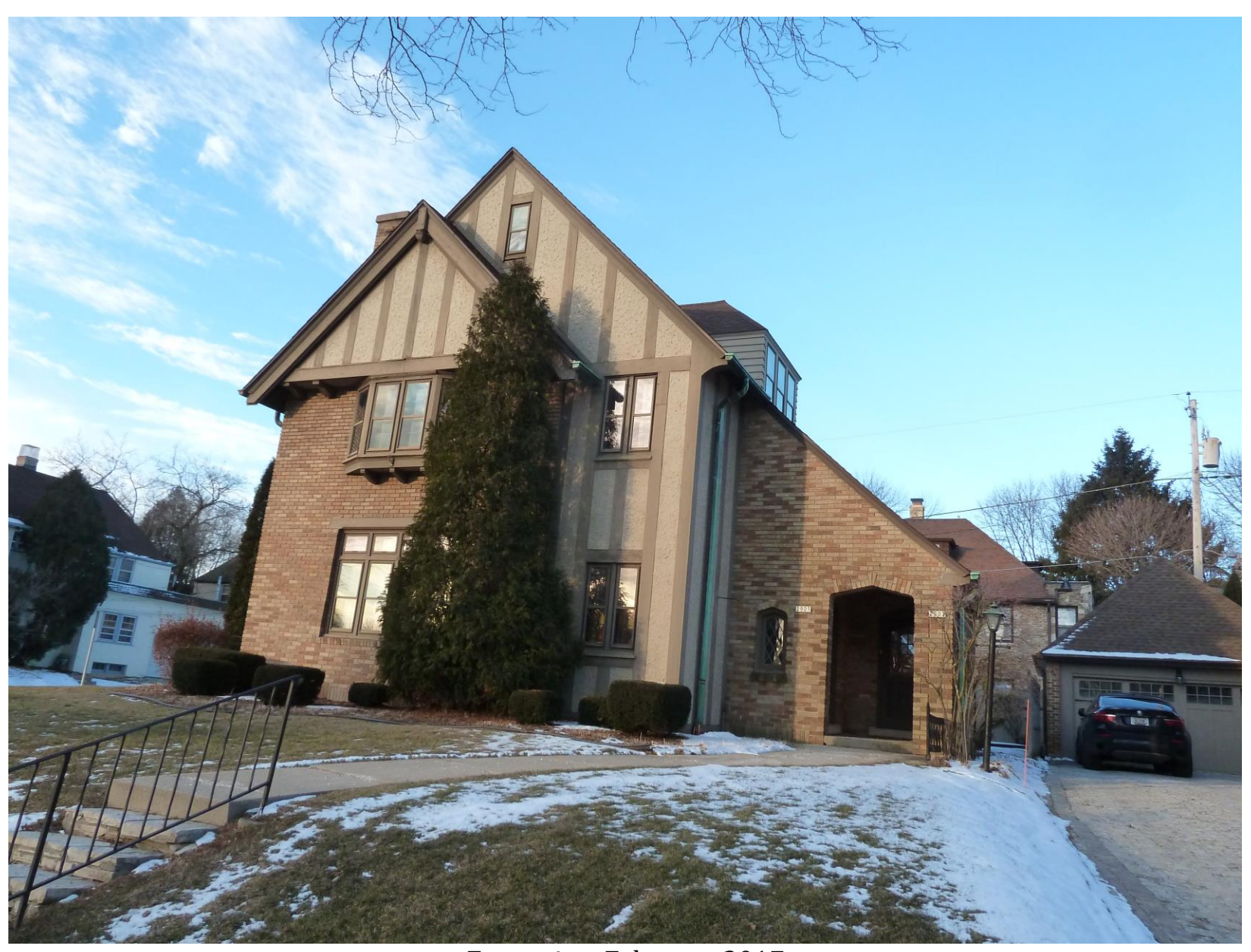
Front view February 2017