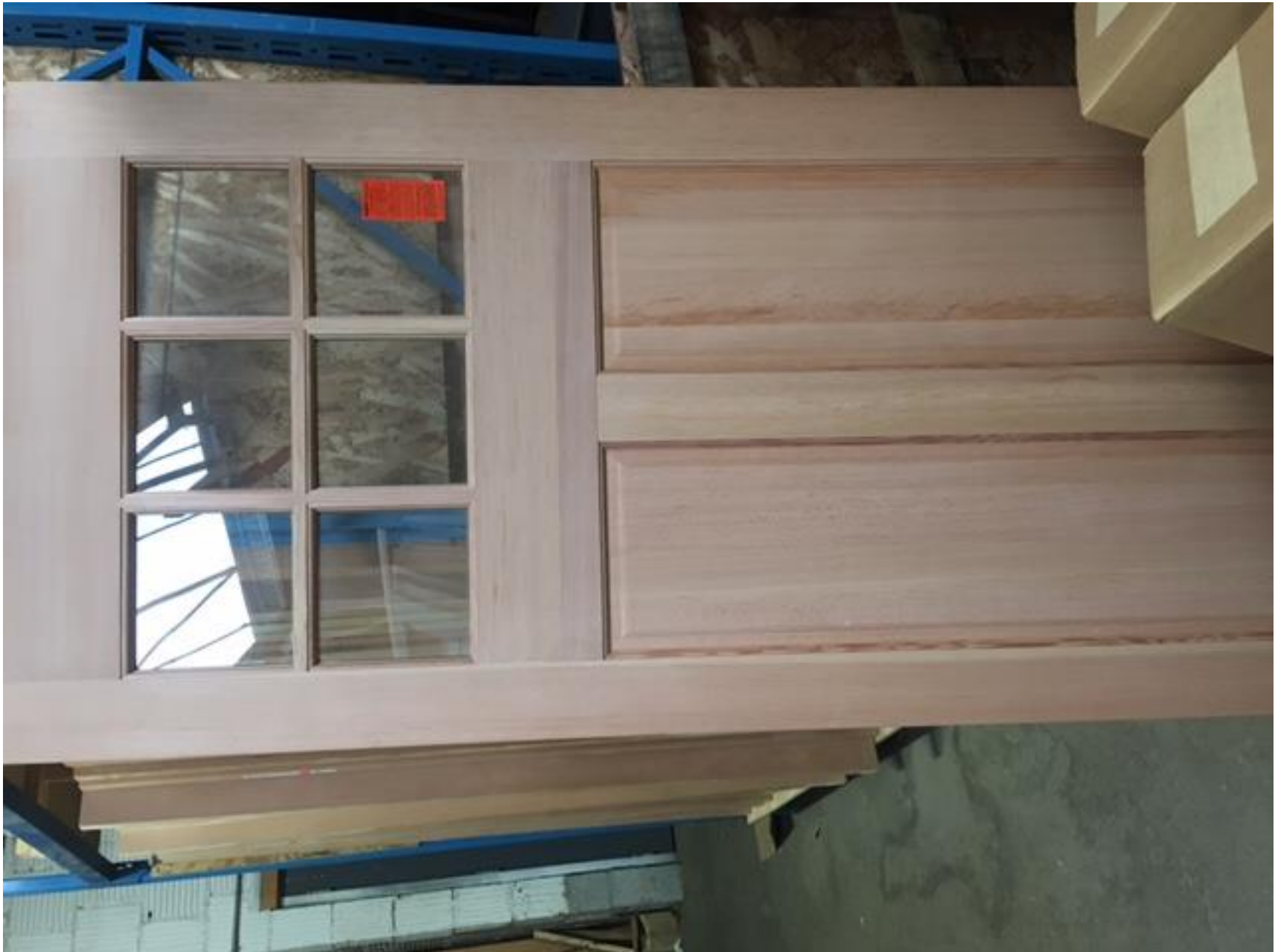
Approved replacement rear door.