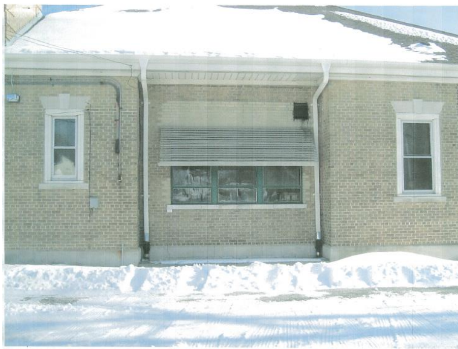
West façade windows to be replaced at center and also awning removed