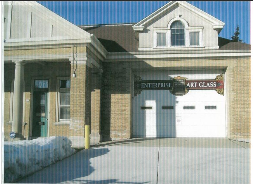
Mockup of signage as it would have been installed. Sign was installed and removed before issuance of this COA.